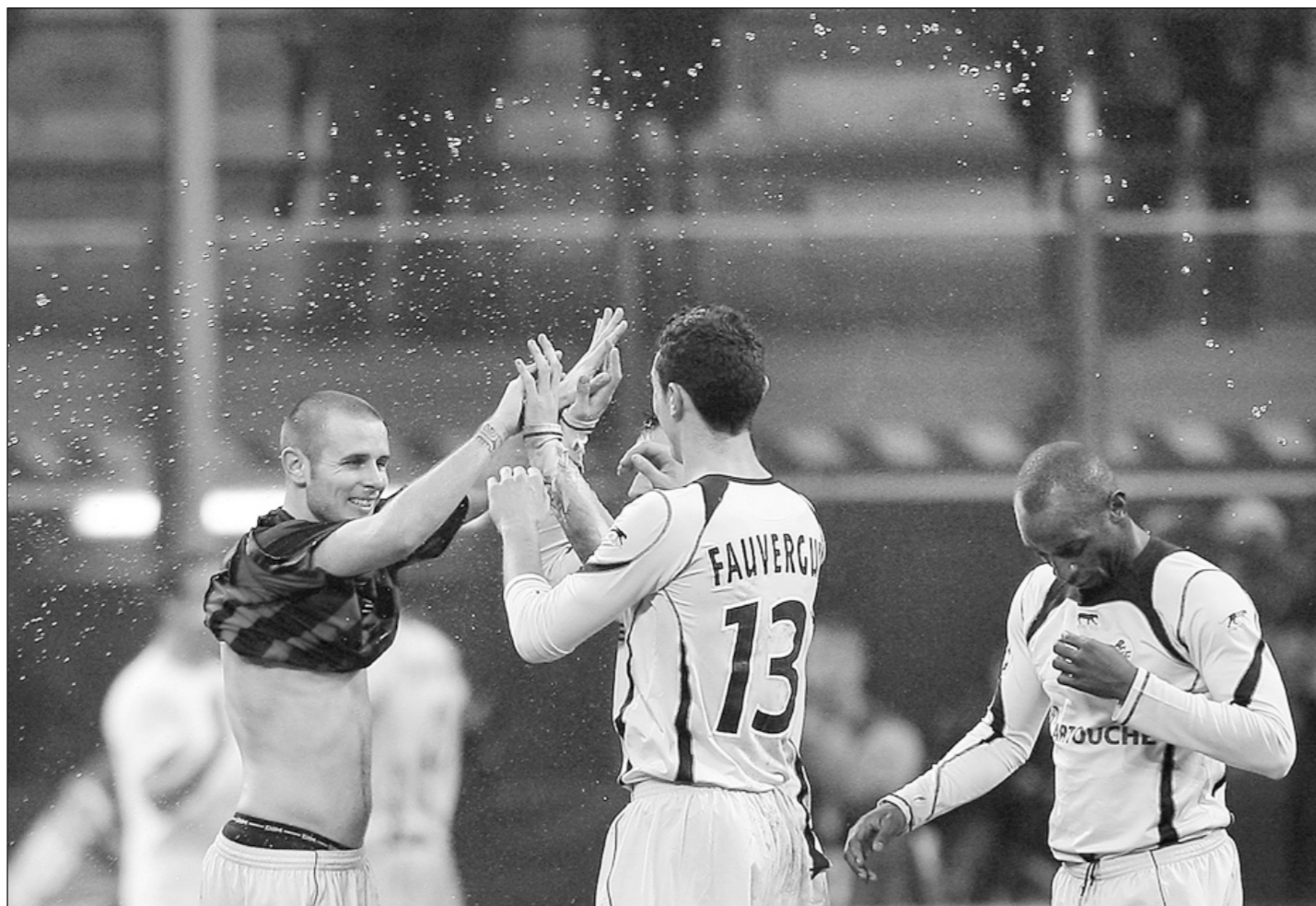
Lille players celebrate after winning their Champion's league match against Milan at San Siro on Wednesday.