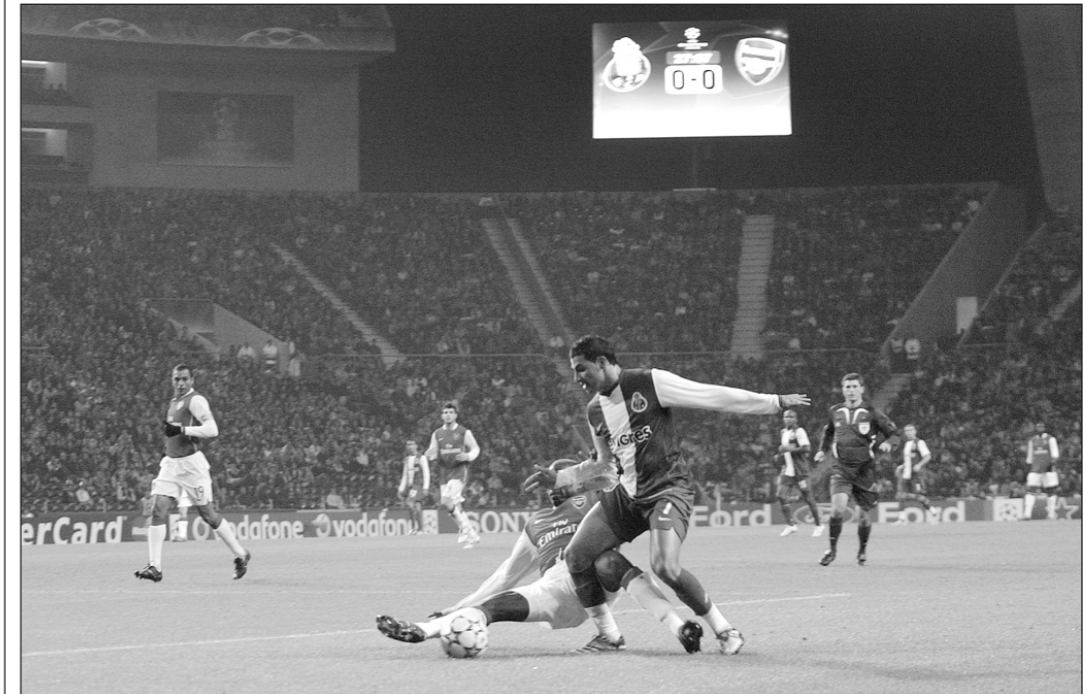
FC Porto midfielder Ricardo Quaresma tries to get the ball past the sliding tackle of Arsenal defender Kolo Toure during their Champions League match at Dragao Stadium in Porto on Wednesday.

However the match ended as it had threatened to finish right from the beginning -- goalless -- and Hamburg won 3-2 anyway.