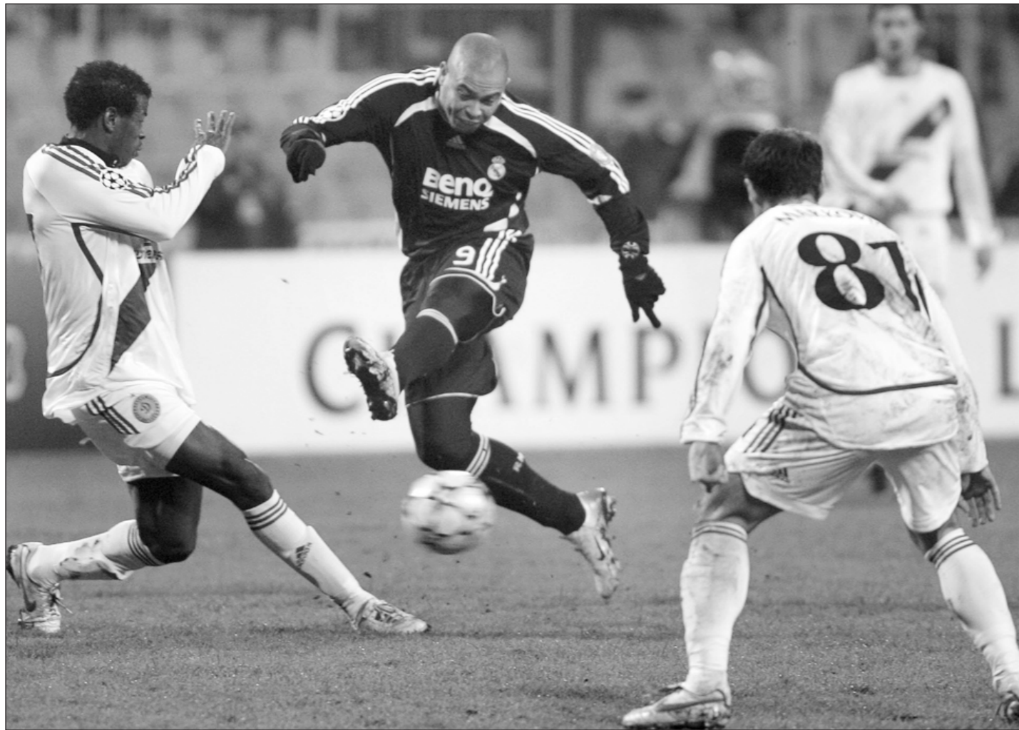
Real Madrid superstar Ronaldo (C) shoots between two Dynamo Kiev defenders during their Champion's League match in Kiev on Wednesday.