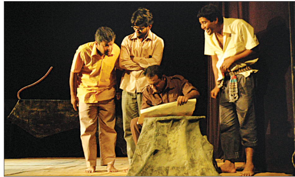
A scene from Shomoy-er Proyojoney