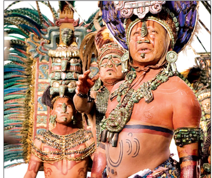
Native American actors in the film Apocalypto

Mel Gibson has been given a huge boost as he prepares to release his latest movie epic Apocalypto this month--Native Americans love the film.