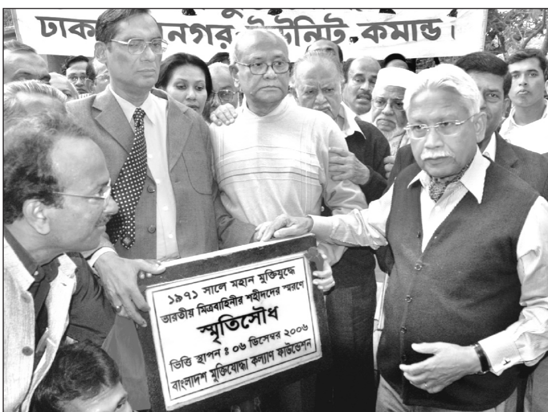
Bangladesh Muktiyoddha Kalyan Foundation lays a foundation stone of a memorial at Suhrawardi Udyan in the city yesterday in memory of the Indian soldiers who were killed during the War of Liberation in 1971.

Save the Children UK also urged all political parties to make arrangement for the bail of all children who were arrested for their participation in different political activities.