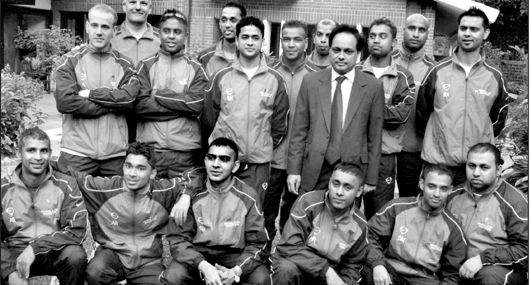
A delegation of second generation British Bangladeshis, who are now on a three-week visit to Bangladesh, pose with British High Commissioner Anwar Choudhury at his residence in the city yesterday.