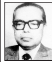
Today is the 15th death anniversary of SM Shafiu Azam, the doyen of civil service of Pakistan and Bangladesh

and former chief secretary of the then East Pakistan, secretary to the central govt of Pakistan, cabinet secretary and minister for jute, commerce and industry, energy and mineral resources, says a press release.