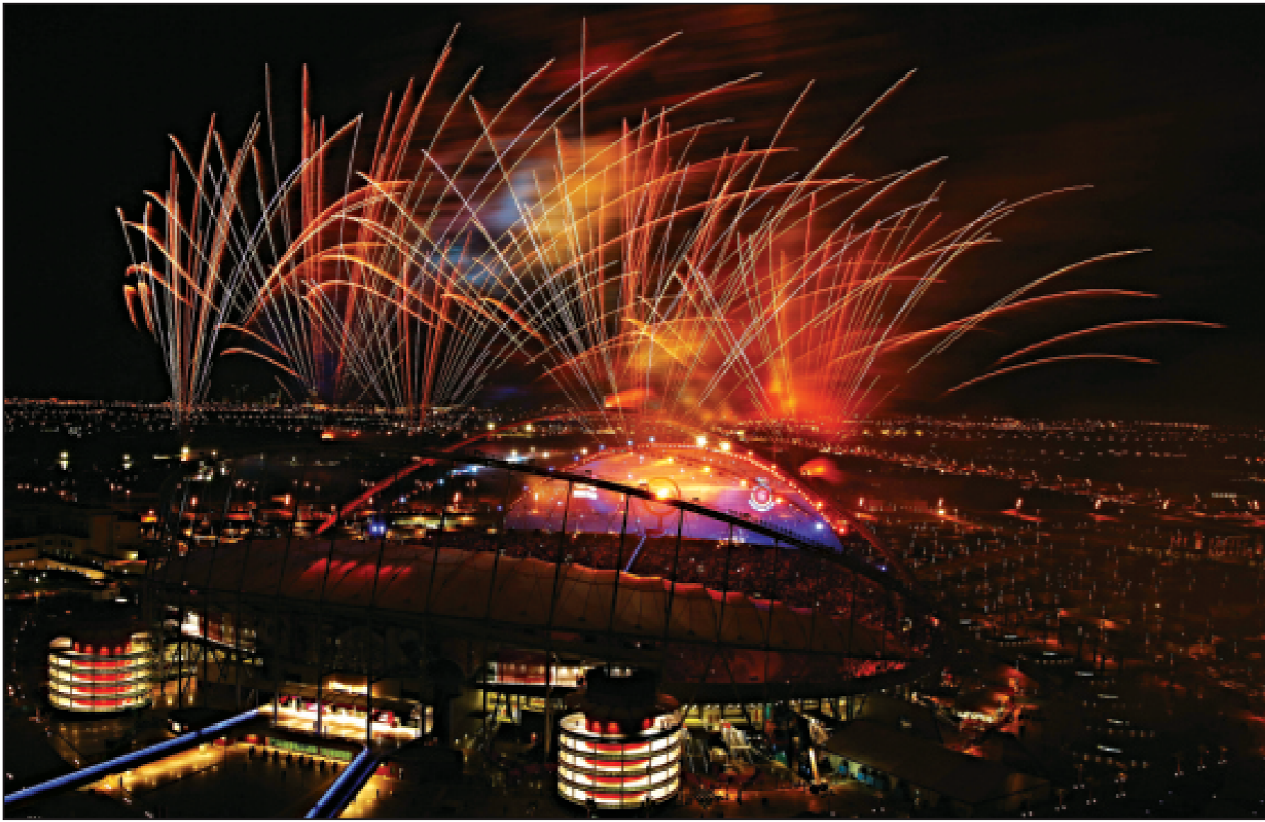
RAINBOW OF COLOURS: Fireworks illuminate the night sky over the Khalifa Stadium in Doha during the opening ceremony of the 15th Asian Games on Friday.