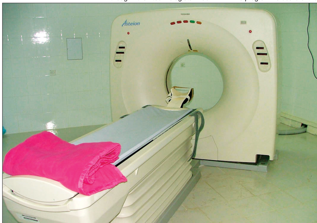
The CT Scan machine of Radiology and Imaging Department at Chittagong Medical College Hospital.

taken any initiative till date. "The programme board of the