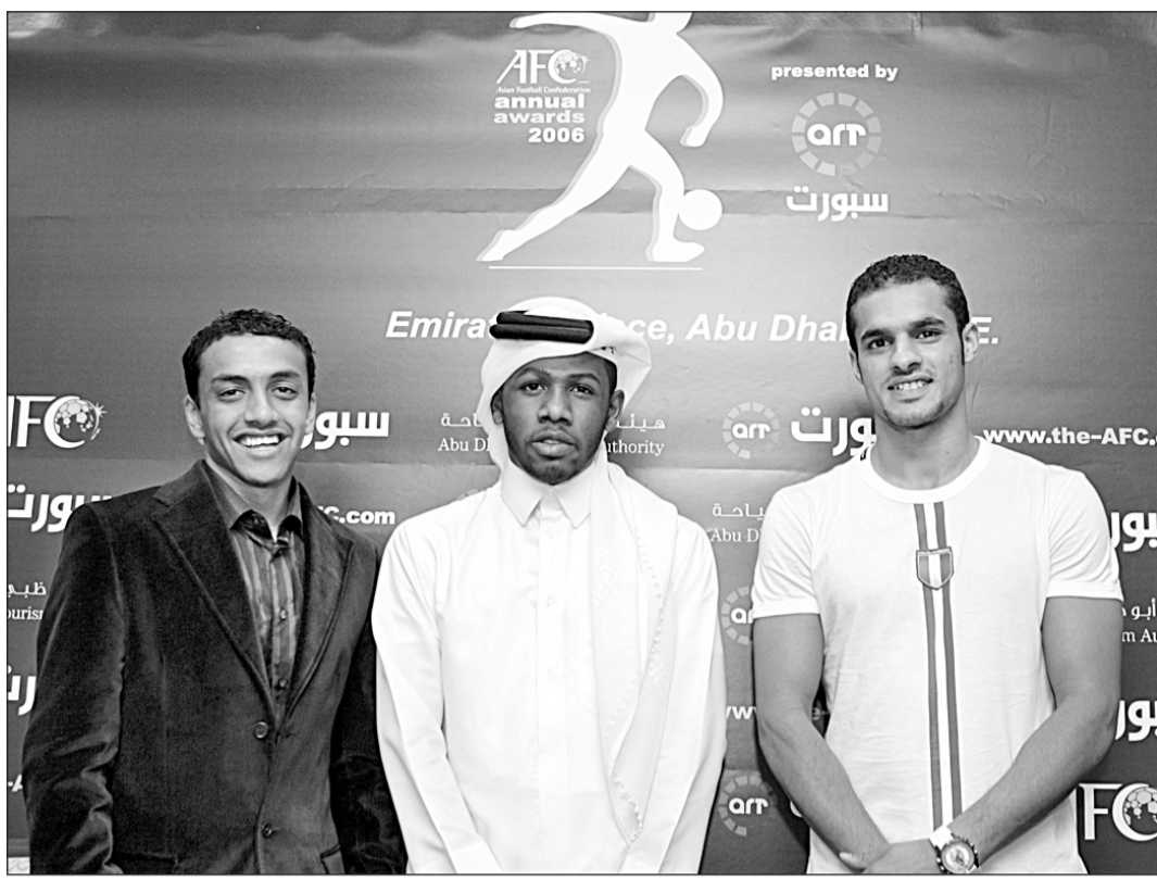
Asian Player of the Year nominees (R-L) Kuwait's Badr al-Mutawa, Qatar's Khalfan Ibrahim and Saudi Arabia's Mohammed al-Shalhoub pose at the AFC Annual Awards 2006 in Abu Dhabi on Tuesday.

"We are particularly proud that, once again, a young player from our own ranks has made his way through to become a full-time professional at the club."