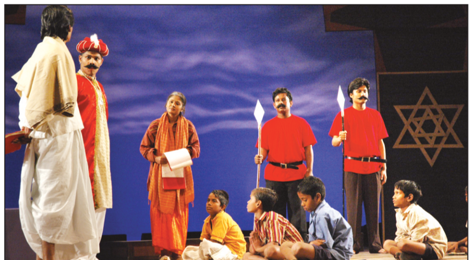
Students of BRAC University and children perform in Hirok Rajar Deshe

Granted three wishes by the Bhuter Raja (King of Ghoul), Goopy and Bagha possess magical powers. Soon, they receive an invitation from the King of Hirok, who rules his kingdom with an iron fist,