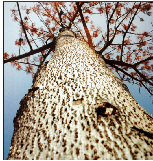
Photographs at the exhibition