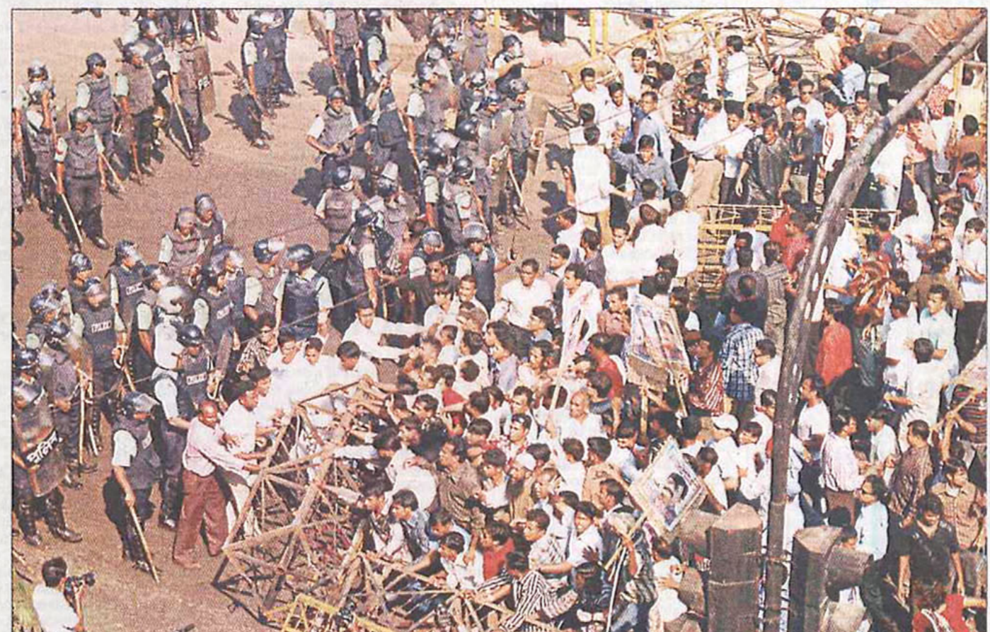
The 14-party activists try to break through the barricades put up by the police near Dhanmondi Road-27 yesterday as they march towards the Election Commission to lay siege to the office.