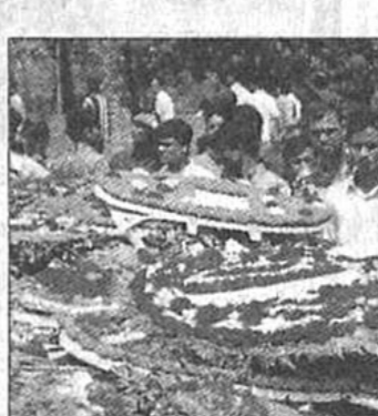
NSU students placed wreath at National Mausoleum at Savar on the Occasion of Victory Day on December 16

Department of English: -Bachelor of Arts in English -Master of Arts in English Department of General and Continuing Education offers general education courses only.