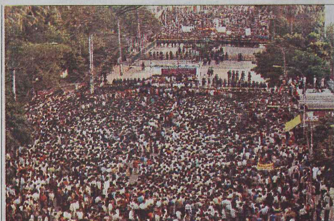
The BNP-led four-party alliance holds a rally at the city's Muktangan yesterday demanding immediate announcement of the election schedule.