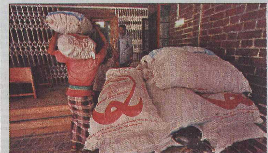
Election materials arrive at the Election Commission (EC) office in Dhaka yesterday as part of the EC's preparations for the next parliamentary polls.