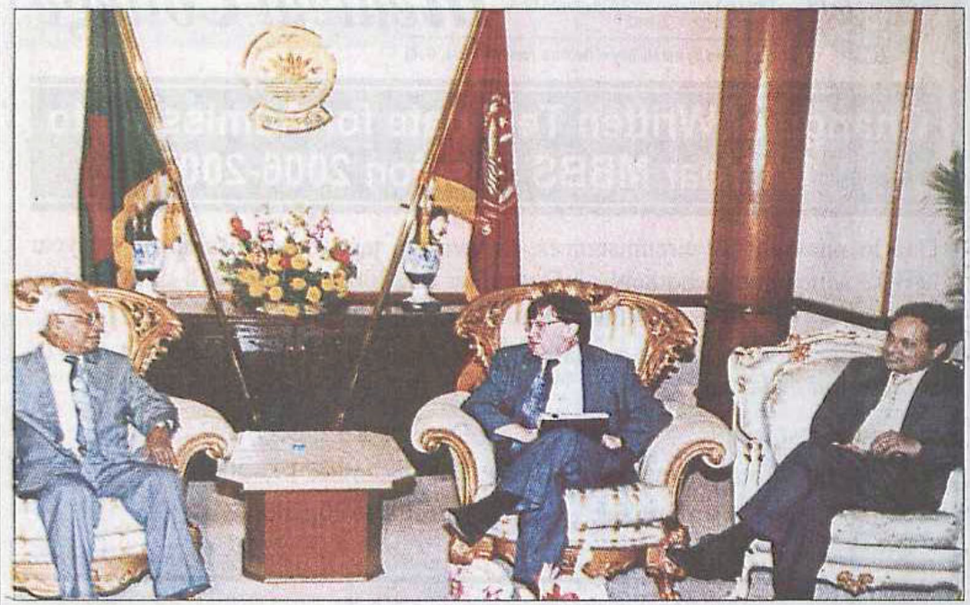
British Minister of State for Trade and Investment Ian McCartney calls on President/Chief Adviser Iajuddin Ahmed at Bangabhaban in the city yesterday.