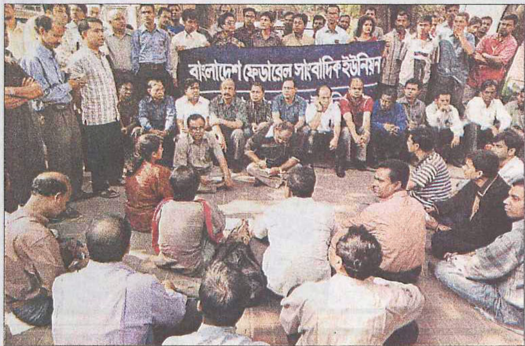
Bangladesh Federal Union of Journalists (BFUJ) and Dhaka Union of Journalists (DUJ) stage a sit-in in front of the Election Commission in the city yesterday demanding easy access to information.

"Admission seekers who bought admission forms under Ka, Kha, Ga and Gha units, but could not submit within the stipulated time, can submit forms at respective dean offices," the press release added.