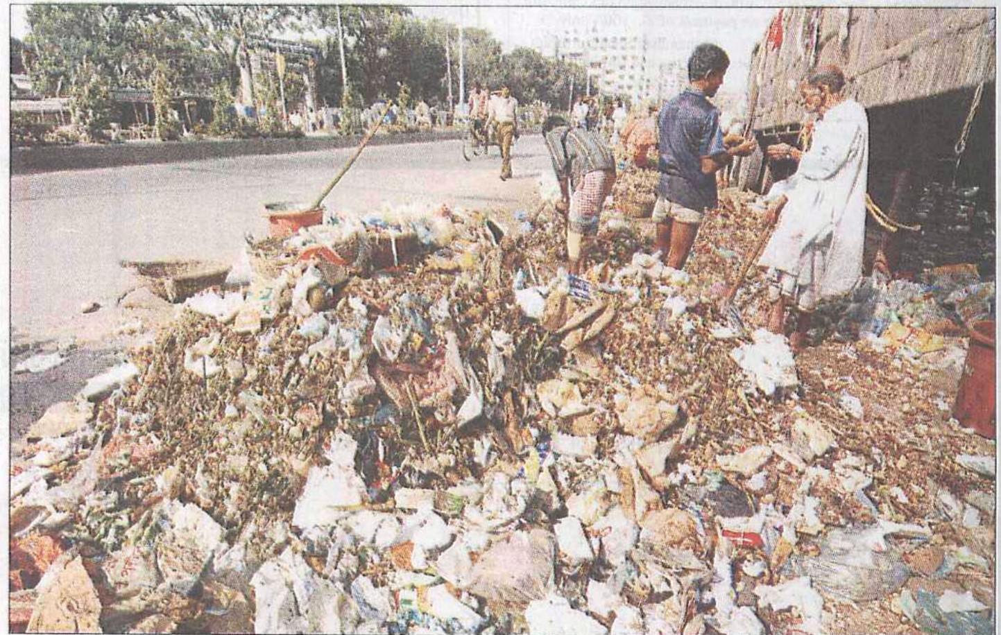
City Corporation turns a blind eye to a huge pile of garbage in front of a school on the Mirpur-1 Technical road, much to the disgust of students, dwellers and commuters.

Three shops were destroyed in the fire, said the shop owners.