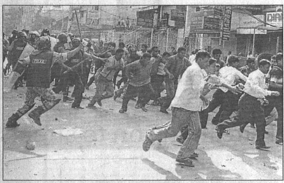
Police club activists of Jatiya Party (Ershad) at Bijoy Nagar in the city yesterday during the blockade programme.