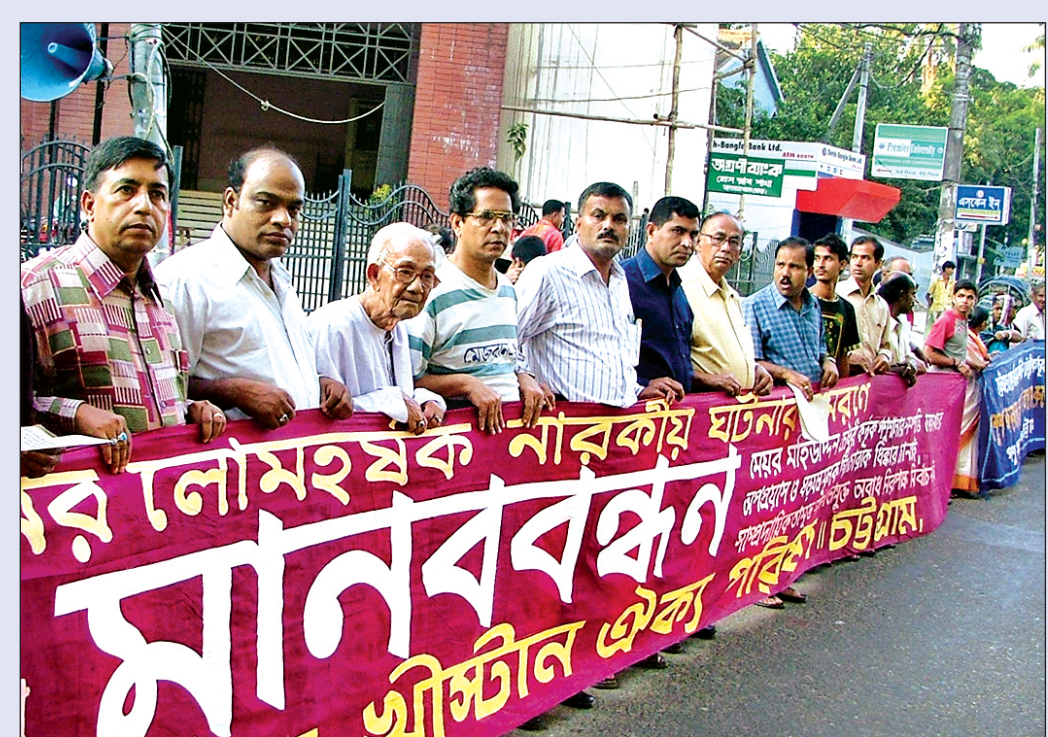
Hindu Bouddah Christian Oikya Parishad forms a human chain in front of Chittagong Press Club demanding immediate punishment to the accused of Banshkhali carnage that left 11 members of a Hindu family burnt alive on November 18, 2003.

Speakers at a function on the occasion urged all to contribute for the welfare of the persons with disability along side the government initiatives.