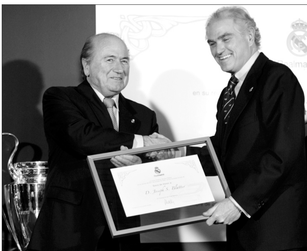
FIFA President Joseph Blatter (L) smiles as he shakes hands with Real Madrid president Ramon Calderon at the Santiago Bernabeu in Madrid on Tuesday. Real Madrid held a tribute in the FIFA Presidents honour.