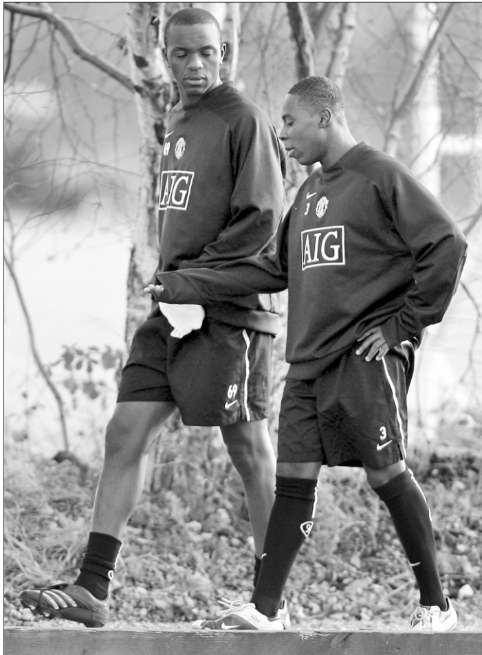
USA player Freddy Adu (R) is pictured with a colleague in Manchester United's training ground of Carrington in Manchester on Monday.

CRYPTOQUIP KYMJDQMIA NCDIALI AYDMQLIVDJLCQAVYMM-KDMNMLGARDA,ZGADA QDQI'ARDAAVMZDCC. Yesterday's Cryptoquip: IF A GYMNAST TUMBLES A BIT TOO FAR ON THE FLOOR, YOU MIGHT SAY HE BOUNDS OUT OF BOUNDS. Today's Cryptoquip Clue: Q equals D