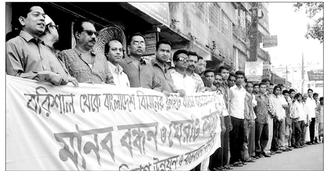
After locking Biman office, Barisal Bibhag Unnyan Parishad formed a human chain on its premises yesterday demanding resumption of Dhaka-Barisal flights.