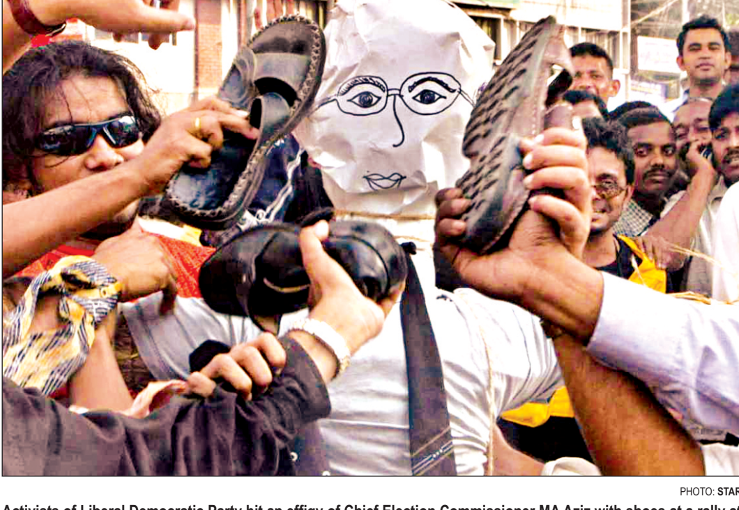
Activists of Liberal Democratic Party hit an effigy of Chief Election Commissioner MA Aziz with shoes at a rally at Moghbazar in the capital yesterday.