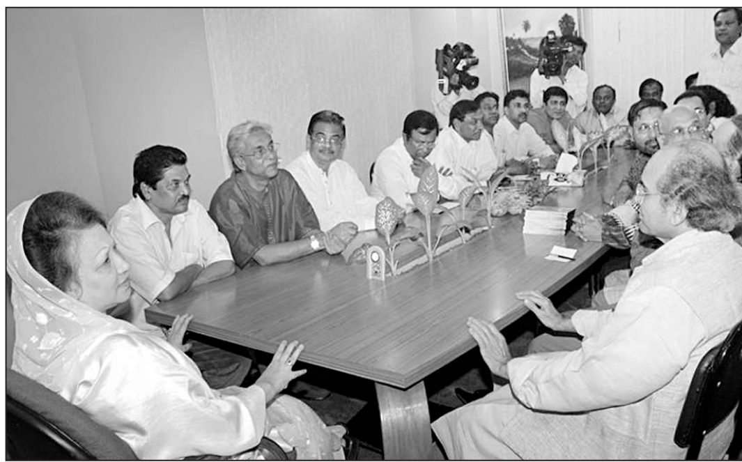
BNP Chairperson and immediate past prime minister Khaleda Zia exchanges views with cultural personalities at her Hawa Bhaban office in the city yesterday.

On this day in 1971, Samad embraced martyrdom in a battle. Local people renamed the area where he was killed as Samadnagar.