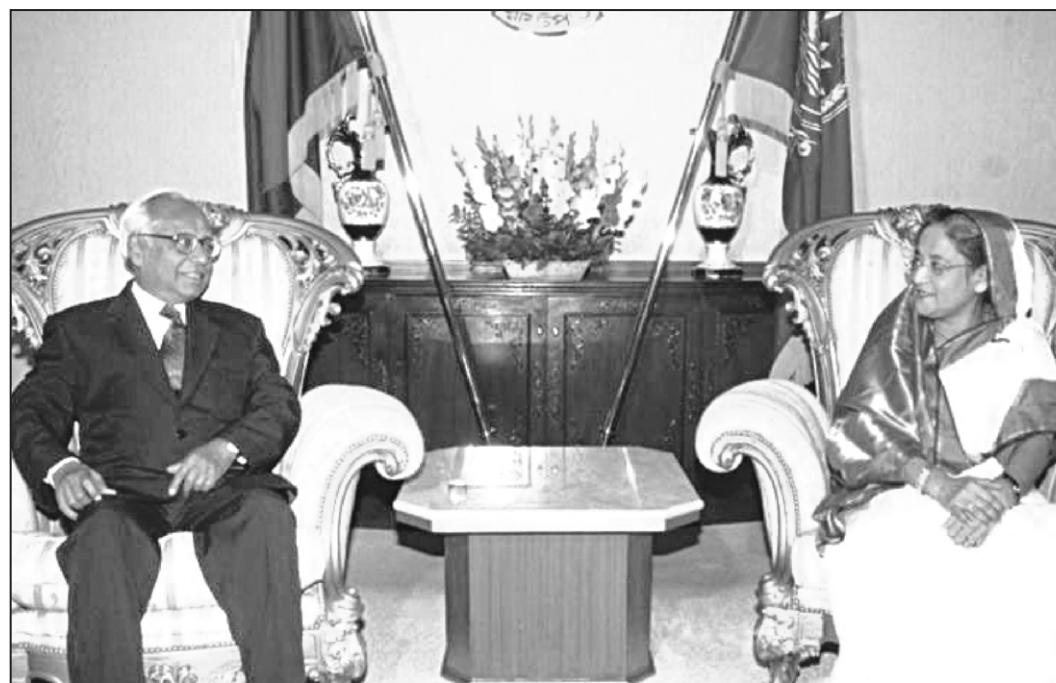
Awami League President Sheikh Hasina calls on President/Chief Adviser to Caretaker Government Iajuddin Ahmed at Bangabhaban in the city yesterday.

Saif Powerlec on Saturday, however, served a notice to the CPA demanding compensation of Tk 10 lakh per day for failing to allow the company operate the crane as per agreement.