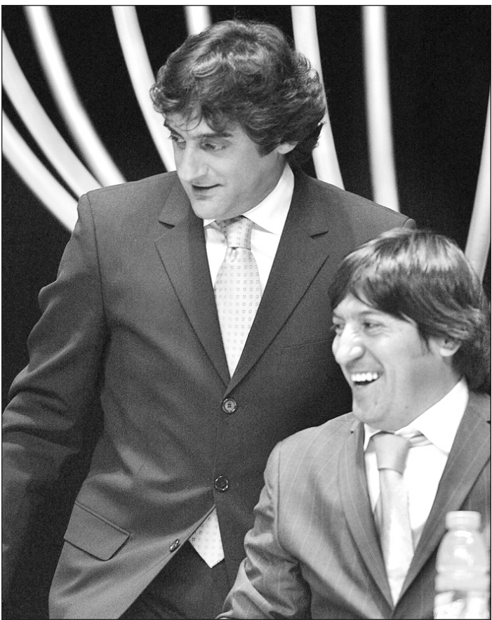
Ex-football stars Uruguayan Enzo Francescoli (L) and Chilean Ivan Zamorano smile during the second day of the 4th World Congress of Football in Pachuca, Mexico on Friday.

CRYPTOQUIP QMV XZKYEJ BZX BZA EHH IEGJXV. LE AEG XGWEXV MV LKLF'Q SE QMJEGSM QMV WJEWVJ IMZFFVYX? Yesterday's Cryptogram: IF A BEACI-DWELLING CRONE IS TIRED OF HER LIFE IN GENERAL, IS SHE A SAND WITCH BORED? Today's Cryptogram Clue: L equals D