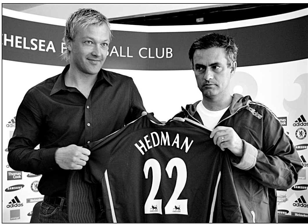
Swedish goalkeeper Magnus Hedman (L) poses with his new shirt alongside coach Jose Mourinho at Chelsea's training ground in Cobham on Friday.

"Playing regular first-team football for the first time in his career will provide him with great experience which can only stand him in good stead."