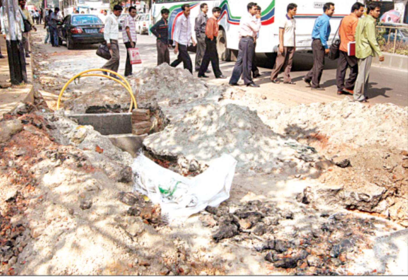
Authorities have turned a blind eye to the suffering of commuters and pedestrians caused by road digging from Science Laboratory to High Court intersection in the city. The road was dug for installation of underground cables, but no steps have been taken to repair the road on urgent basis.

party for realising its own demands. "The constitution must be upheld above all when the solution of confrontational issues related to present crisis comes up on priority basis in the greater interest of the nation and democracy," said Dr