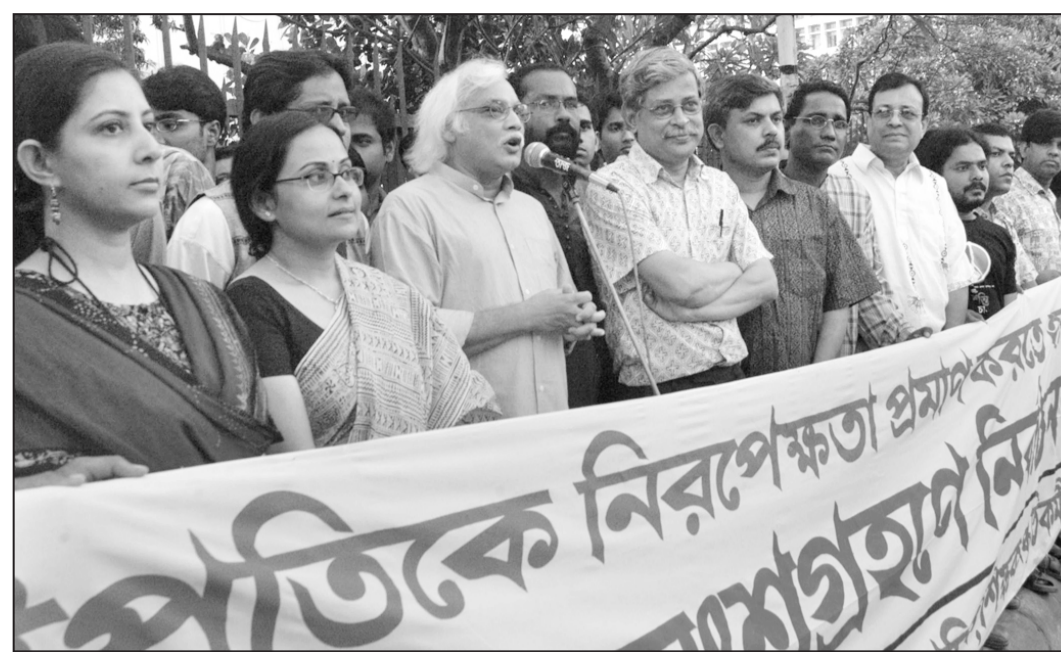
Young writers, poets and journalists form a human chain at Shahbagh in the city yesterday urging the president/chief adviser to prove his neutrality.