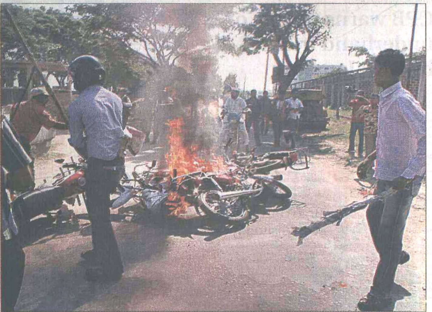
Activists of Jatiyatabadi Chhatra Dal and Islami Chhatra Shibir set fire to several motorcycles of 14-party men at Chondipul in South Surma, Sylhet, on the fourth day of blockade yesterday.