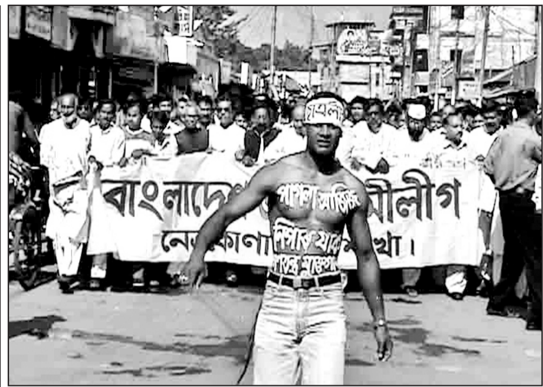
The 14-party brought out a procession in Netrakona town yesterday, the third day of its countrywide blockade, to press its 11-point demand including resignation of CEC MA Aziz.

Because of lack of fire station at Dimla, fire fighters took a long time to reach the spot from Nilphamari, 60 kilometre away from the spot.