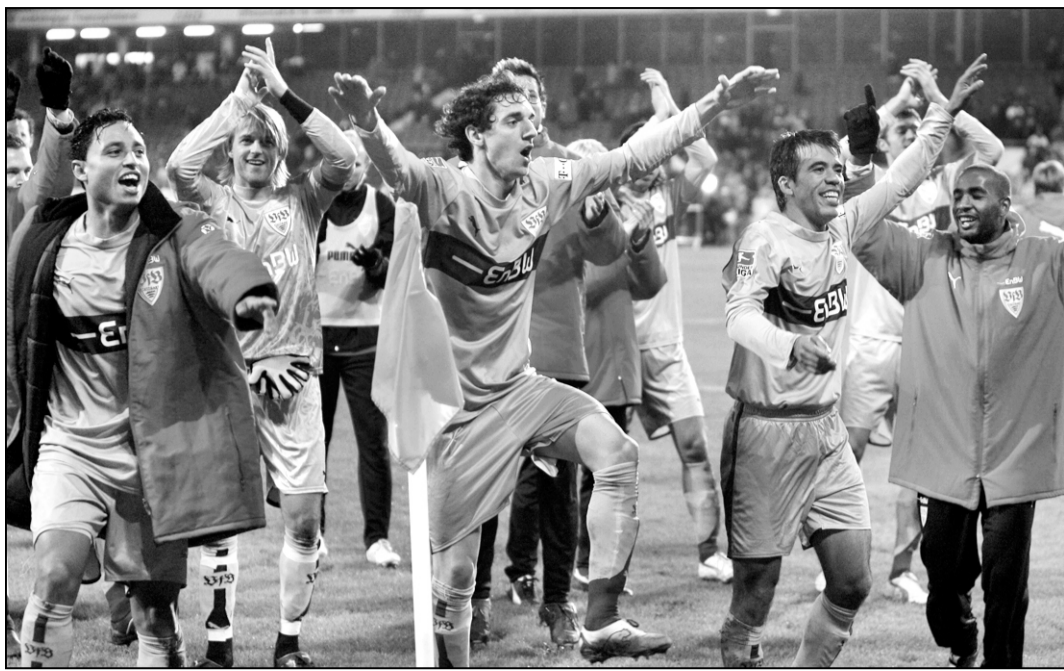
Stuttgart players are ecstatic at the end of their Bundesliga match against Hannover on Sunday. Stuttgart won the match 2-1.

"If by chance Barcelona wanted to sign me, with all the respect I have for this club, the answer would be no."