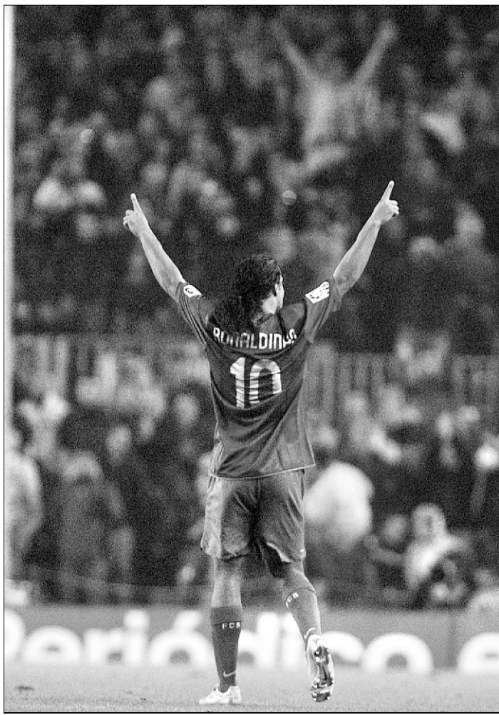
Barcelona star Ronaldinho points to the heavens after his match-winning exploits against Primera Liga rivals Real Zaragoza at the Nou Camp on Sunday.

Bayern striker Lukas Podolski is also injured and Low must pick either Mike Hanke or Oliver Neuville to partner Miroslav Klose in attack.