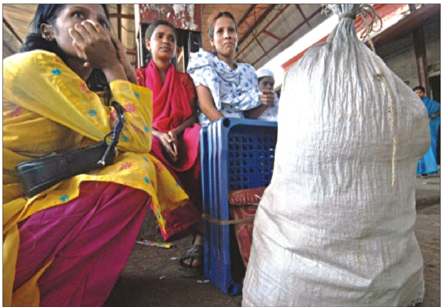
Passengers are stranded at Tongi Railway Station yesterday as the 14-party blockade snapped rail communication between the capital and other districts.

head of Hamas's majority faction in parliament, Khalil al-Hayya, said the agreement on a