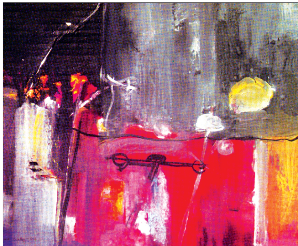
Jatrapala by Najma Akhter

Najma Akhter's solo exhibition at Shilpangan