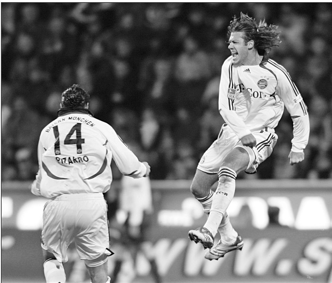
Bayern Munich defender Martin Demichelis (R) jumps in joy as striker Claudio Pizarro looks on after the former scored against rivals Bayer Leverkusen during their Bundesliga clash at the Bay Arena in Leverkusen on Saturday.

The former Real Sociedad star knows the Merseysiders are in better shape in the UEFA Champions League than with domestic matters.