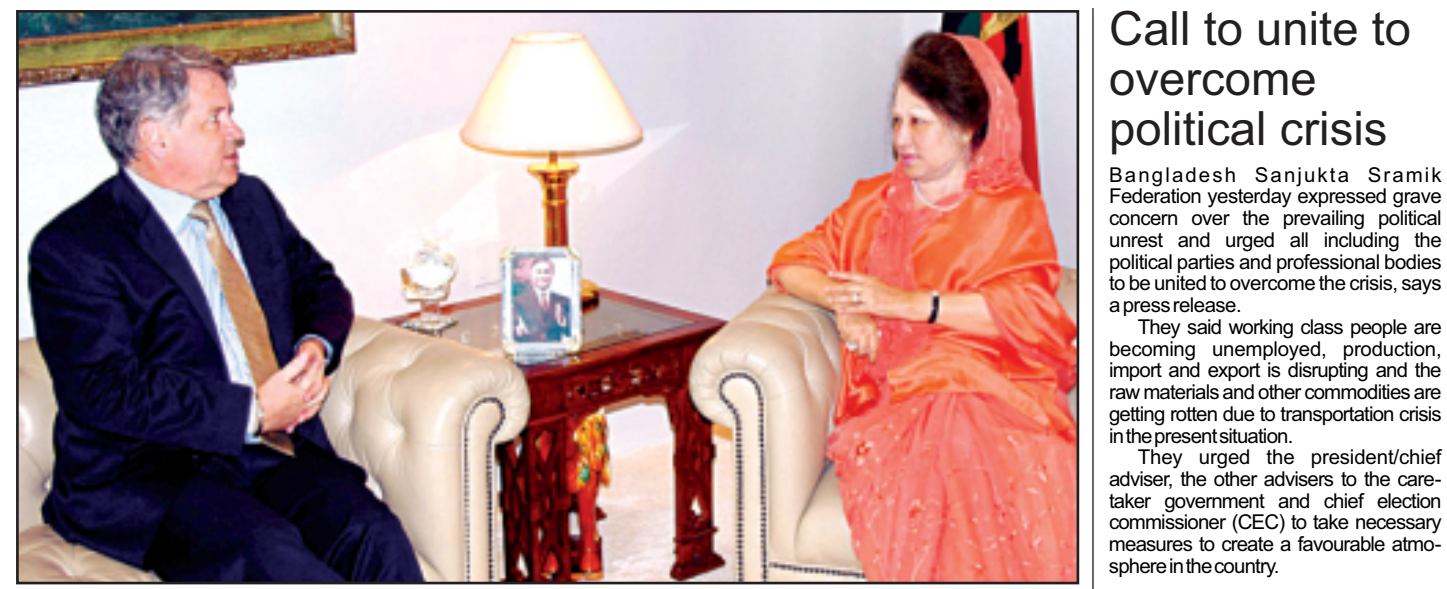
Australian High Commissioner Douglas Foskett calls on BNP Chairperson and immediate past prime minister Khaleda Zia at her Banani office in the city yesterday.