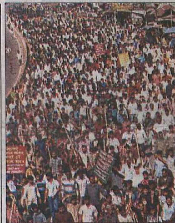
14-party in support of its blockade programme brings out a procession, left, from Cherag Ali shopping centre in Tongi yesterday that marched towards Tongi Railway Station; Activists of 14-party stopped a train at Tongi Rail Gate and set fire to one of its seats.