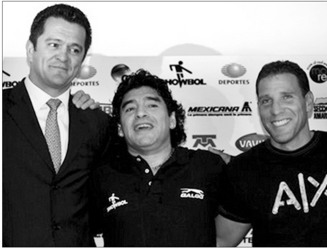
Argentina legend Diego Armando Maradona (C) poses with ex-Mexican stars Carlos Hermosillo (L) and Garcia Aspe in Mexico City on Friday.

"It is a blow for us. When I look at my team I always think which players can keep playing and Momo could always play," Benitez said. "Even if the game were two days later he would be fit. He is a big player for us."