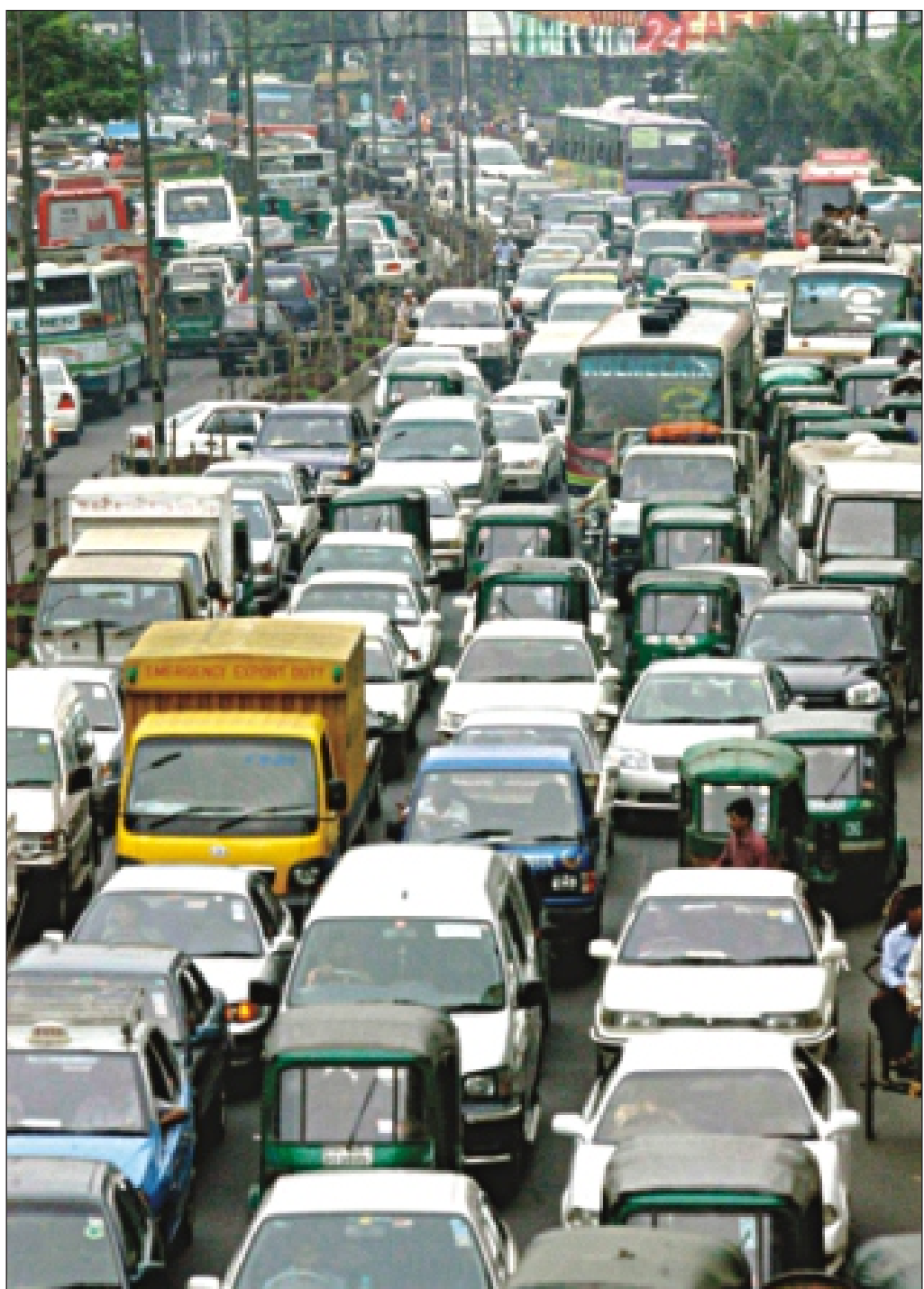
Vehicles come to a standstill at Shahbagh on Kazi Nazrul Islam Avenue in the capital yesterday as Jubo Sangram Parishad's Election Commission siege programme created huge traffic pressure at certain points of the city streets.