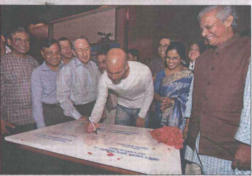
Football superstar Zinedine Zidane signs a stone plaque at the inaugural ceremony of Grameen Danone Food Ltd at Sonargaon Hotel in the capital yesterday. Nobel Peace Prize winner Prof Muhammad Yunus is also seen.