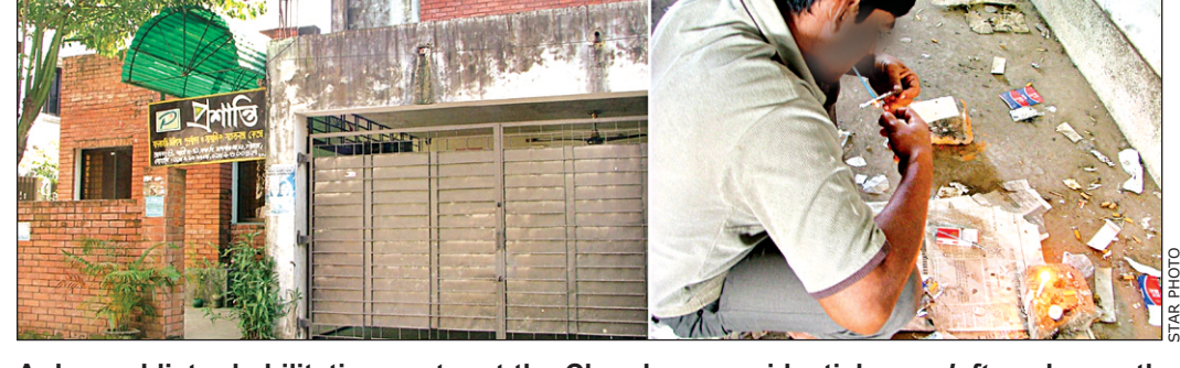
A drug addict rehabilitation centre at the Chandgaon residential area, left, and a youth takes heroin in broad daylight at a corner of Chittagong Stadium shopping complex, right.

"We are thinking of seeking advice from Dhaka in this regard and will take step accordingly," he