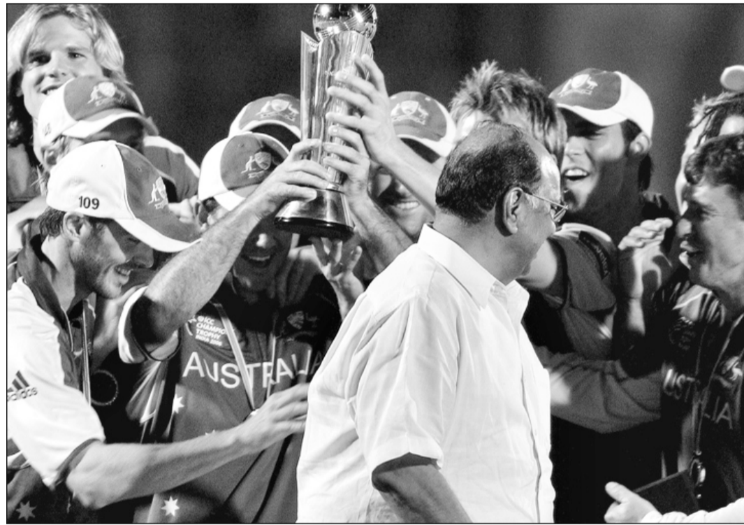
Australian batsman Damien Martyn (L) is seen urging Indian cricket chief Sharad Pawar off the presentation dais so the team could pose with the trophy after their ICC Champions Trophy triumph over West Indies in Sunday's final in Mumbai.

The Test series will be followed by a five-match one-day series.