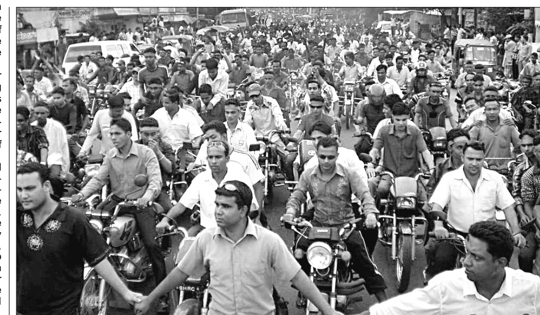
Jubo League activists brought out a motor cycle rally in Sylhet yesterday demanding reform in Election Commission and realisation of their 11-point demand.

preater agitation if the principal failed to take action against the culprits without further delay