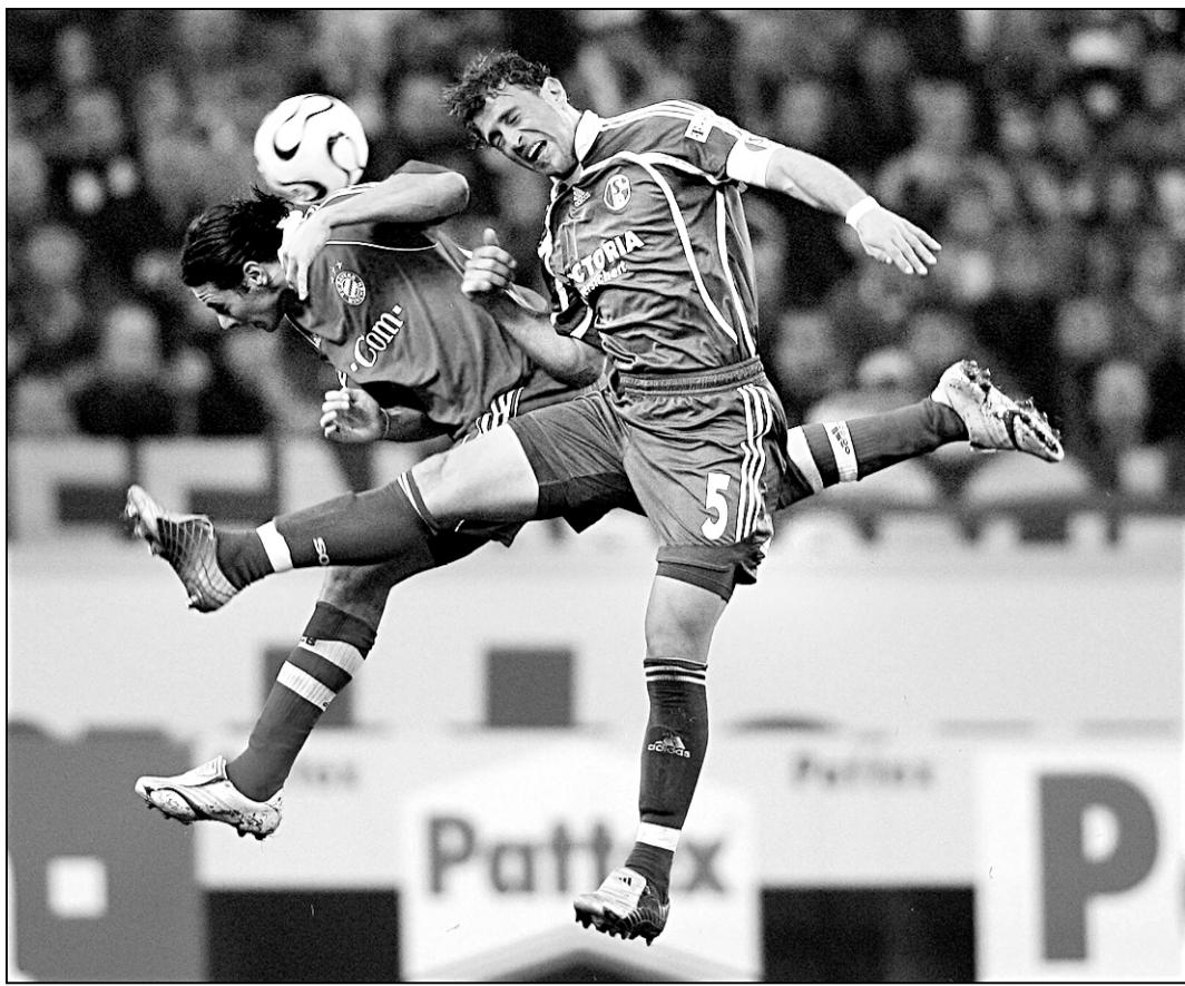
Schalke 04's Marcelo Bordon (R) and Bayern Munich's Claudio Pizarro are airborne for the possession of the ball during their Bundesliga match in Gelsenkirchen on Sunday.

Fulham manager Chris Coleman called for a prison sentence for the coin-thrower in Saturday's 1-0 win, telling the BBC: "I hope the offender is identified. It was a coward who threw the coin."