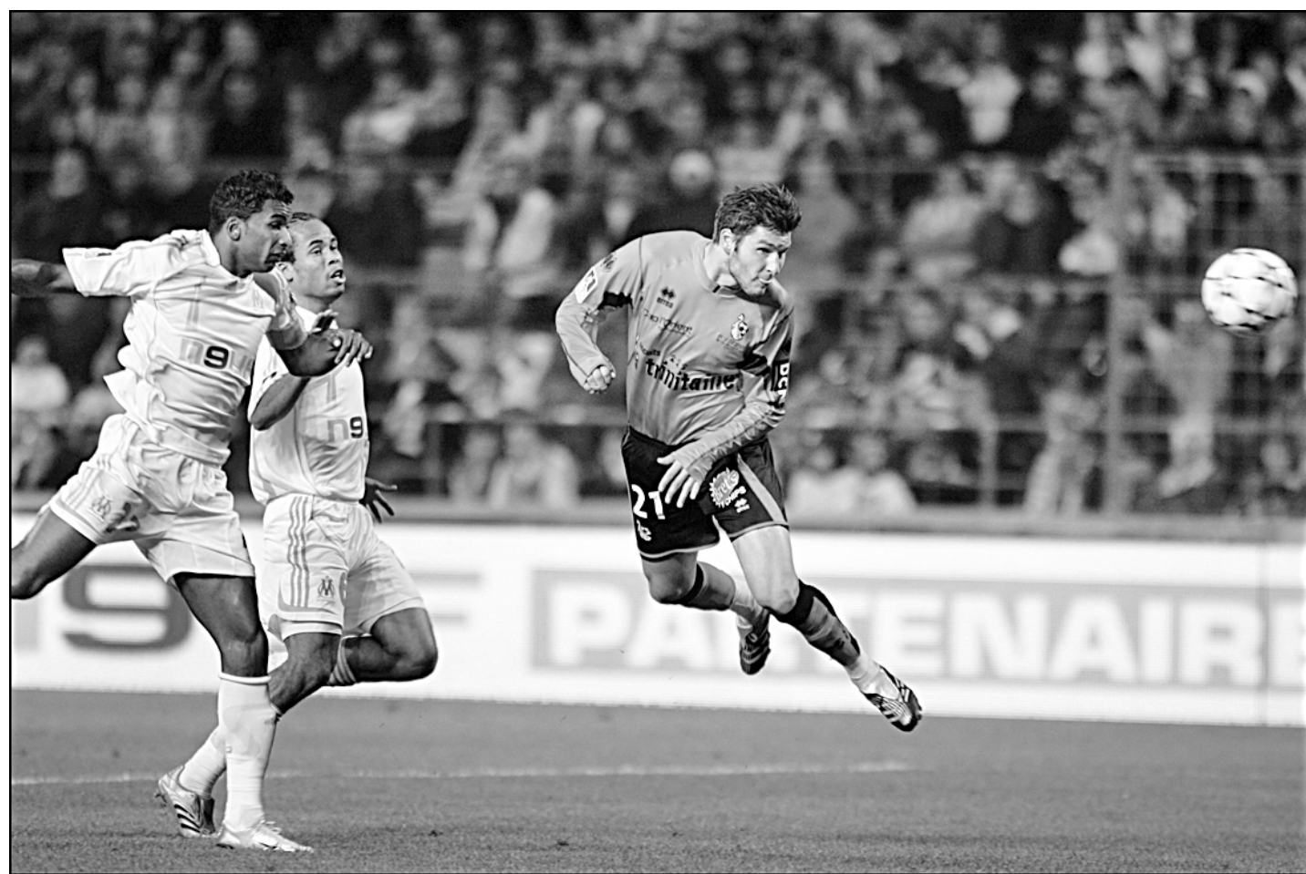
Lorient forward Andre-Pierre Gignac (R) heads towards the Marseille goal during their Ligue 1 match at the Velodrome Stadium in Marseille on Saturday.