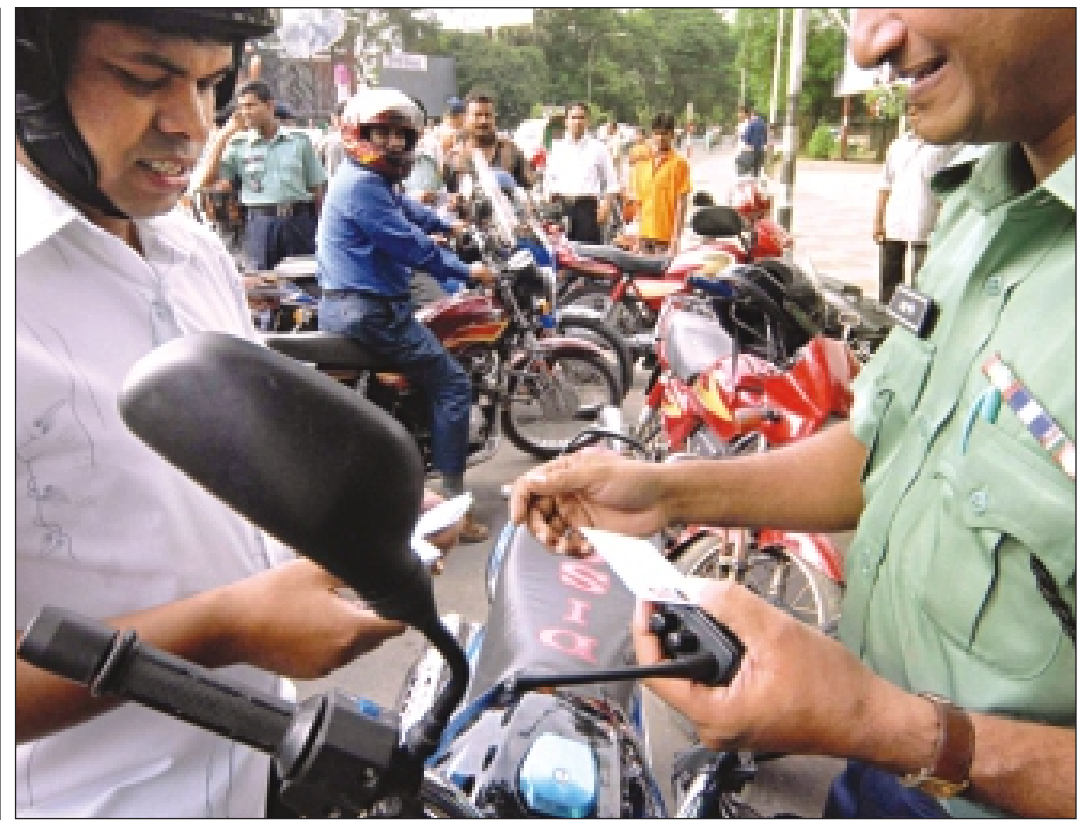
Policemen conduct a special search of motorbikes in the capital following a drive-by shooting on the house of former law minister Moudud Ahmed Saturday. The photo was taken from the TSC roundabout in Dhaka University yesterday.

Stressing the urgency for taking measures to cut government expenditure in maintaining macro-economic stability, Akbar said election and political unrest might put tremendous pressure to the government coffers. In the coming days, increased election expenses would multiply that pressure, he added. SEE PAGE 15 COL 3