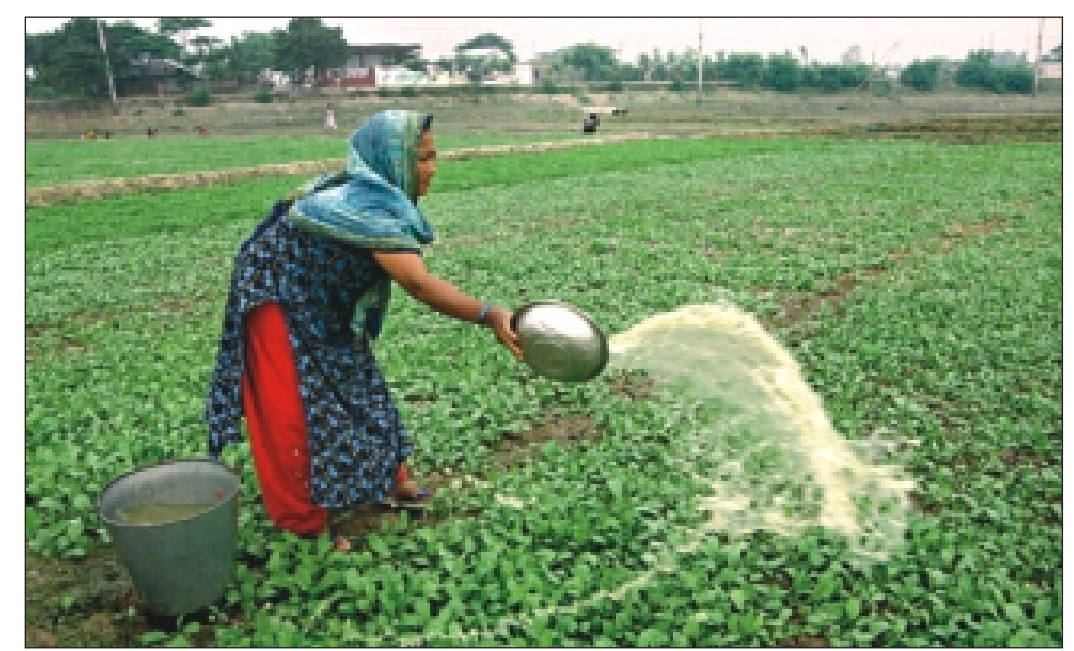
A woman waters her vegetable garden at Nandi Para on the city outskirts from where farmers supply a huge amount of vegetables to the capital.

The sources said a group of leaders who are known as liberal and committed to the party leadership wants to see a positive end to the crisis. They believe it will help ensure a free and fair election. But SEE PAGE 15 COL 3