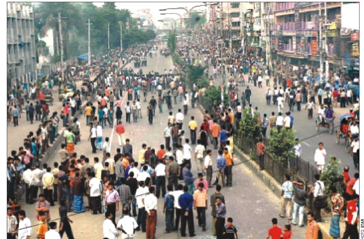
Mirpur Road after movement of vehicles came to a halt during a clash between Jatiyatabadi Chhatra Dal and Bangladesh Chhatra League activists on the Dhaka College premises yesterday.