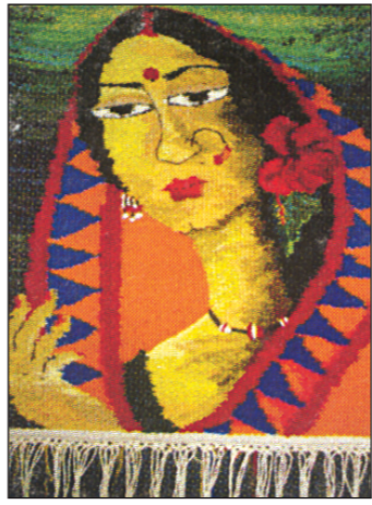
(L-R) Devota (applique), Maa o Shishu (wood) and A New Bride (tapestry)