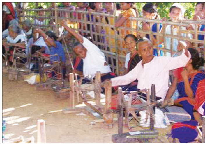
Devotees participate in chibar weaving

Shrimoth Pragyabangsa Mohasthabir delivered a speech.