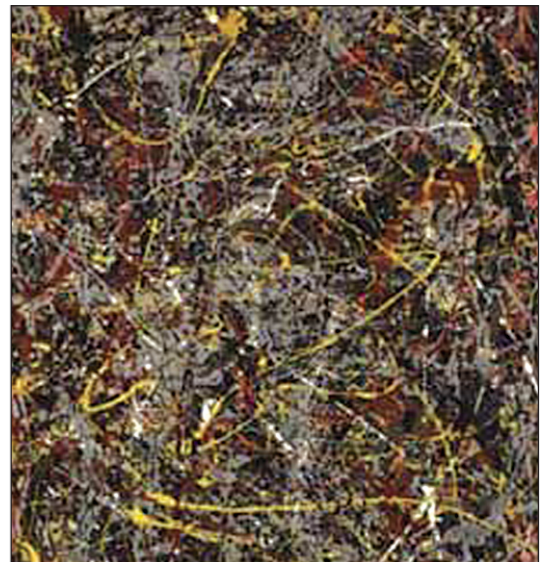
No 5, 1948 by Pollock

Pollock was born in 1912 and suffered from depression and alcoholism. He died in a car crash at the age of 44. Pollock , a film on the artist's life, was made in 2000. Oscar nominee Ed Harris played the role of Pollock in the film.