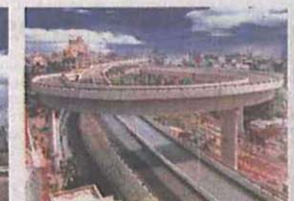
Khilgaon Flyover, Dhaka