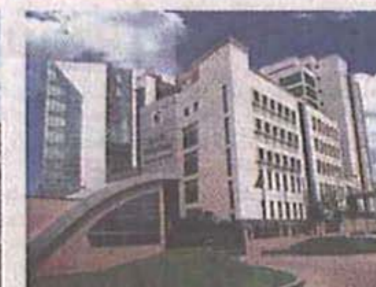
Apollo Hospital, Dhaka