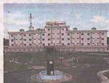
Naaz Garden, Bogra

During 100 years of our journey, we feel proud to be a part of the development of Bangladesh, alike many other countries of the world