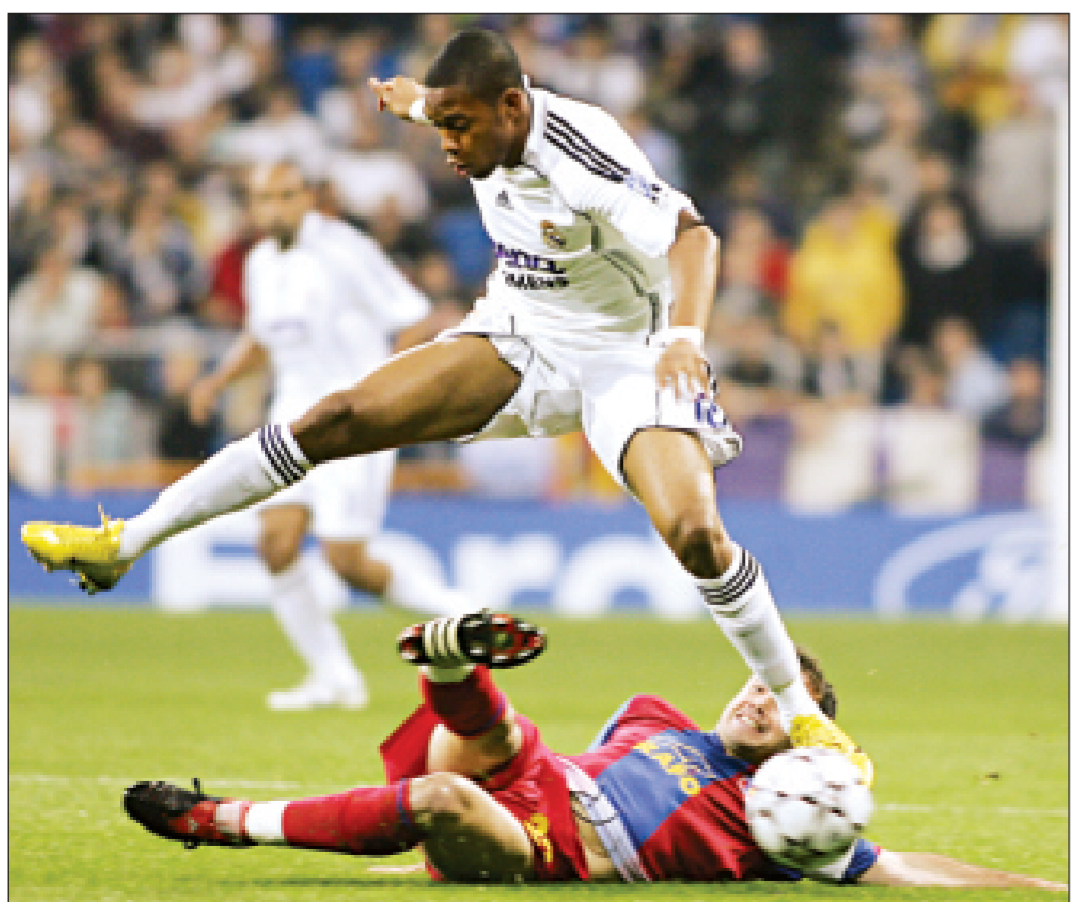
Real Madrid star Robinho (top) jumps to evade a sliding tackle from Steaua Bucharest defender Banel Nicolita during their Champions League match at the Santiago Bernabeu on Wednesday.

striker Mohamed Tchite got in a couple of snapshots, though neither was on target. After Kaka's third, though, the odds were heavily stacked against an Anderlecht comeback. Once again the goal came out of a solo run by the Brazilian but this time, instead of running directly at the opposition, he cut round a defender on the edge of the area before angling a right-footed shot past keeper Daniel Zitka. When Juhasz headed Anderlecht's consolation goal from a corner, Milan briefly looked rattled. Left back Marek Jankulovski almost complicated what should have been a trouble-free night when he botched a clearance and the ball skewed off the post, while Tchite fired in a dangerous ball from close range that Dida managed to smother on his line. Two minutes from time, however, Cristian Brocchi launched a long ball forward for Gilardino who broke the offside trap and thumped in Milan's fourth goal.