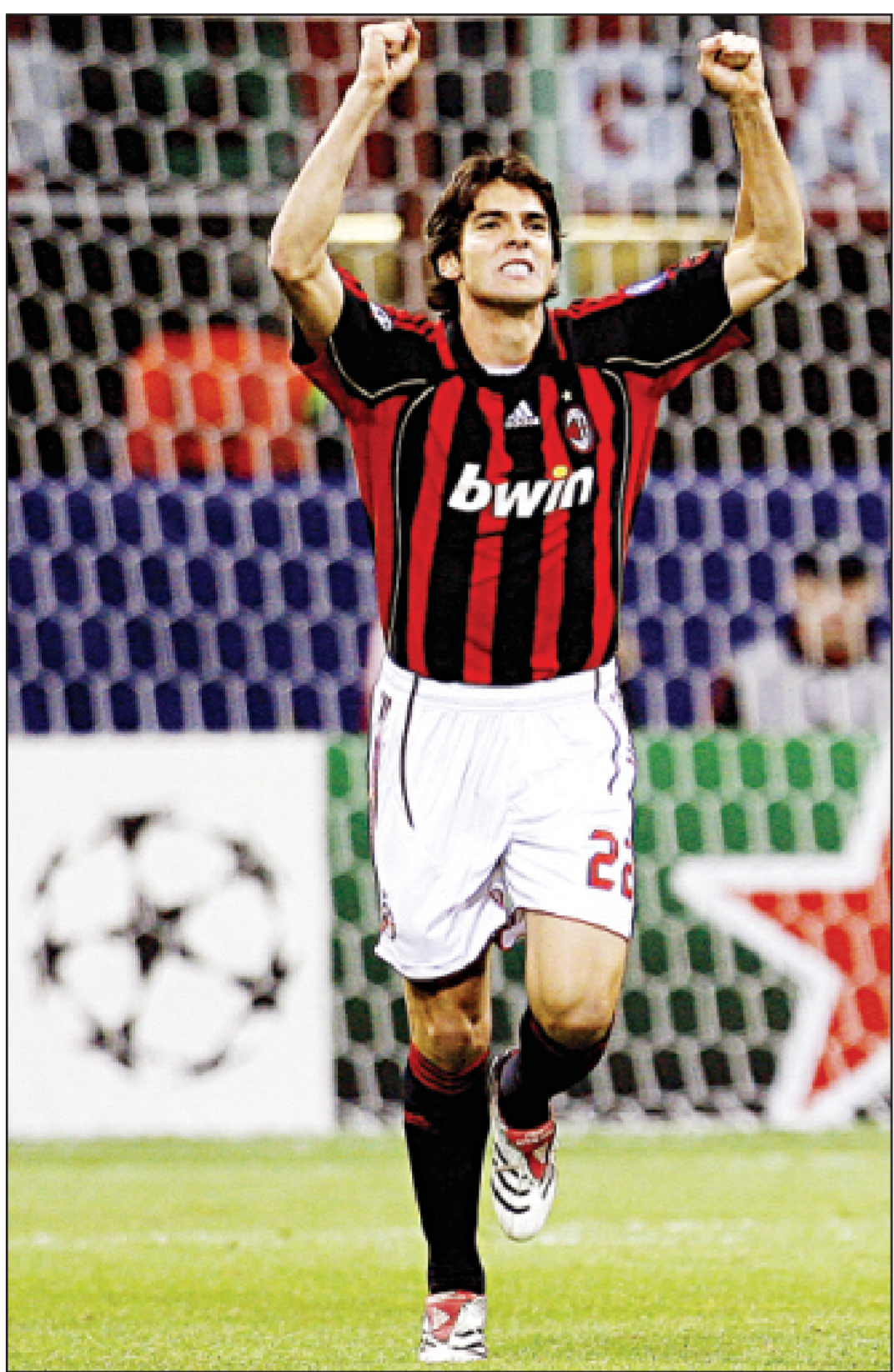
AC Milan forward Kaka celebrates after scoring the first of his three strikes in their Champions League encounter against Anderlecht at the San Siro in Milan on Wednesday.