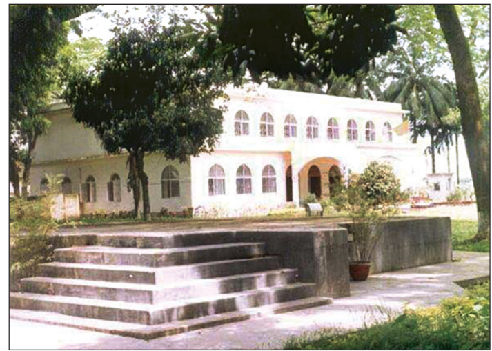
A frontal view of the art gallery

Waiting at the Ferry Ghat , A Malnourished Child in the Lap of his Mother , A Village Woman with a Pitcher on her Waist , Kazi Nazrul Islam , A Woman just after a Bath , A Mexican Woman , Mompura '70 , a painting on the devastating tidal wave in Bhola in 1970 and Life and Struggle . The renovation works of the museum began in 1997 and were completed by June 2004. Every year a five-day-long festival is organised by the gallery authority from December 25 to 29 to celebrate Zainul Abedin's birth anniversary. The programmes include a colourful procession, painting competitions for the children, Zainul fair, discussions on life and works of Zainul and traditional cultural shows featuring Baul songs.