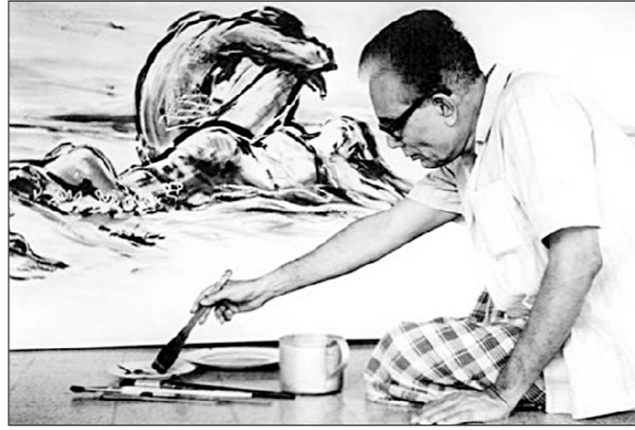
The master painter at work