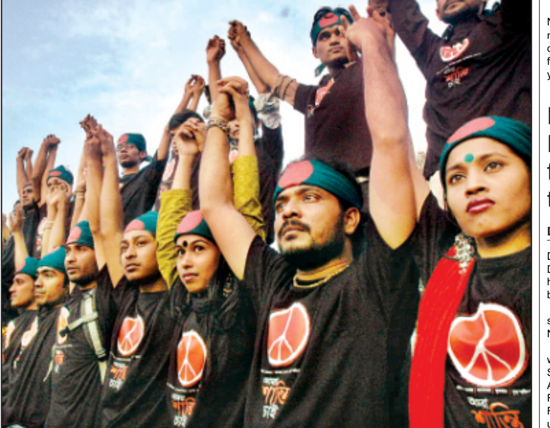
Wearing black T-shirts with peace symbol, people from all walks of life form a human chain at Shahbagh intersection in the city yesterday demanding peaceful atmosphere in the country.