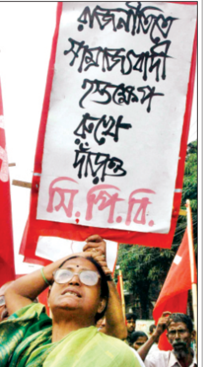
Communist Party of Bangladesh stages a demonstration at Paltan in the city yesterday demanding realisation of their 53-point, including reforms in the election Commission.