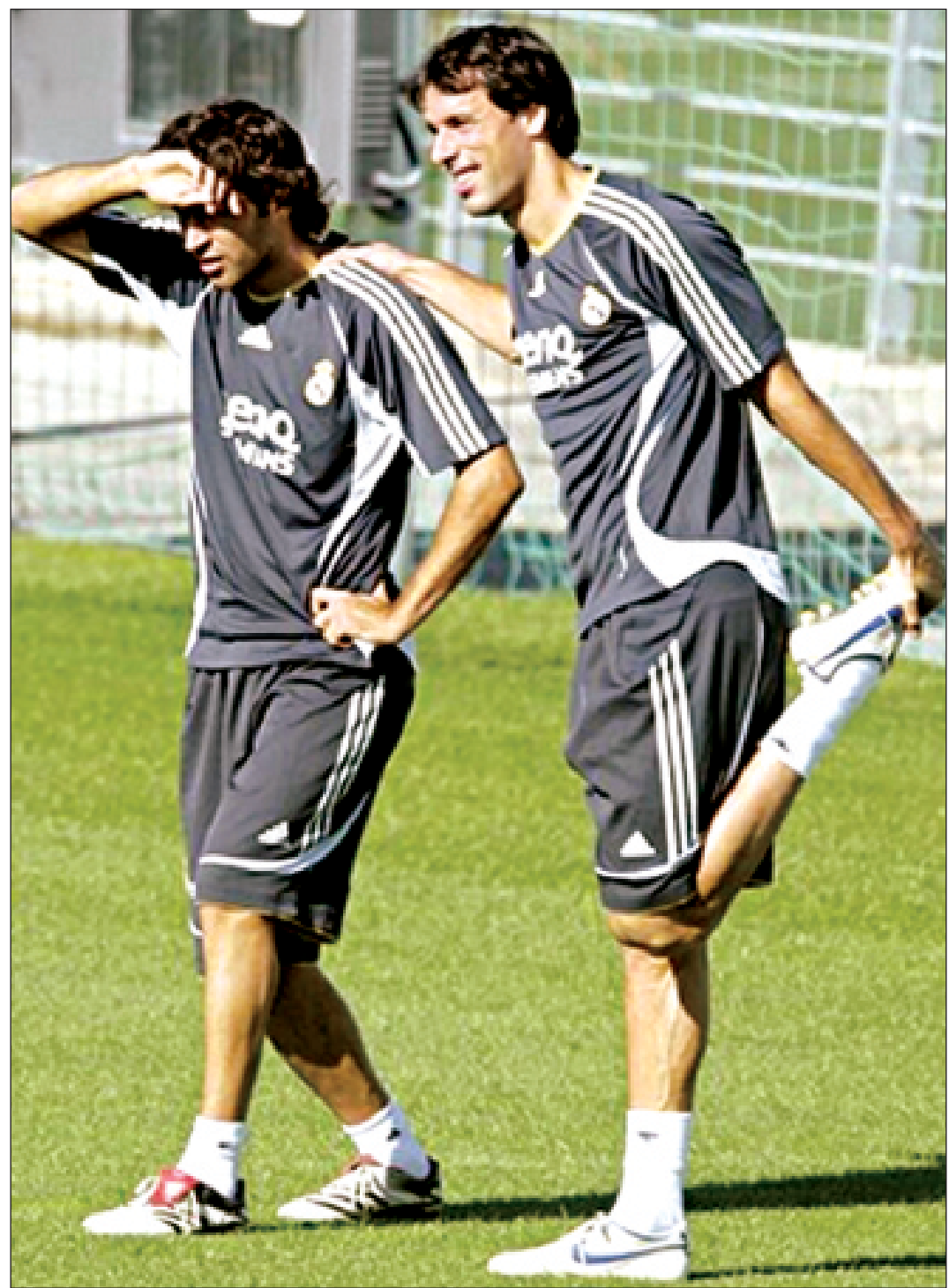
EYEING A SCALP: Real Madrid strikers Raul Gonzalaz (L) and Ruud van Nistelrooy stretch during a training session in Madrid on Monday. Real play Steaua Bucharest in the Champions League tonight.