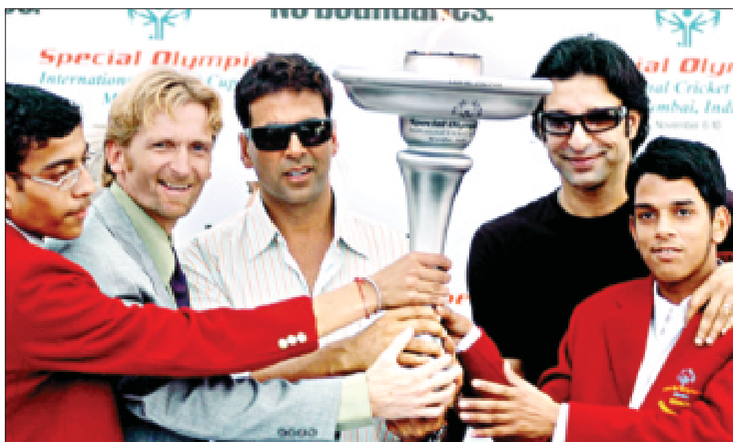
Pakistan legend Wasim Akram (2nd from R), Indian actor Akshay Kumar (C) and other Special Olympics officials hold a torch at a ceremony to announce the Special Olympics International Cricket Cup at Wagah Border on Tuesday.

Goalkeepers: Julio Cesar (Inter Milan), Helton (Porto) Defenders: Lucio (Bayern Munich), Juan (Bayer Leverkusen), Luisao (Benfica), Alex (PSV Eindhoven), Daniel Alves (Sevilla), Maicon (Inter Milan), Adriano Correia (Sevilla), Carlinhos (Santos) Midfielders: Gilberto Silva (Arsenal), Edmilson (Barcelona), Fernando (Bordeaux), Dudu Cearense (CSKA Moscow), Elano (Shakhtar Donetsk), Diego (Werder Bremen), Daniel Carvalho (CSKA Moscow), Kaka (AC Milan) Forwards: Ronaldinho (Barcelona), Robinho (Real Madrid), Rafael Sobis (Real Betis), Ricardo Oliveira (AC Milan)