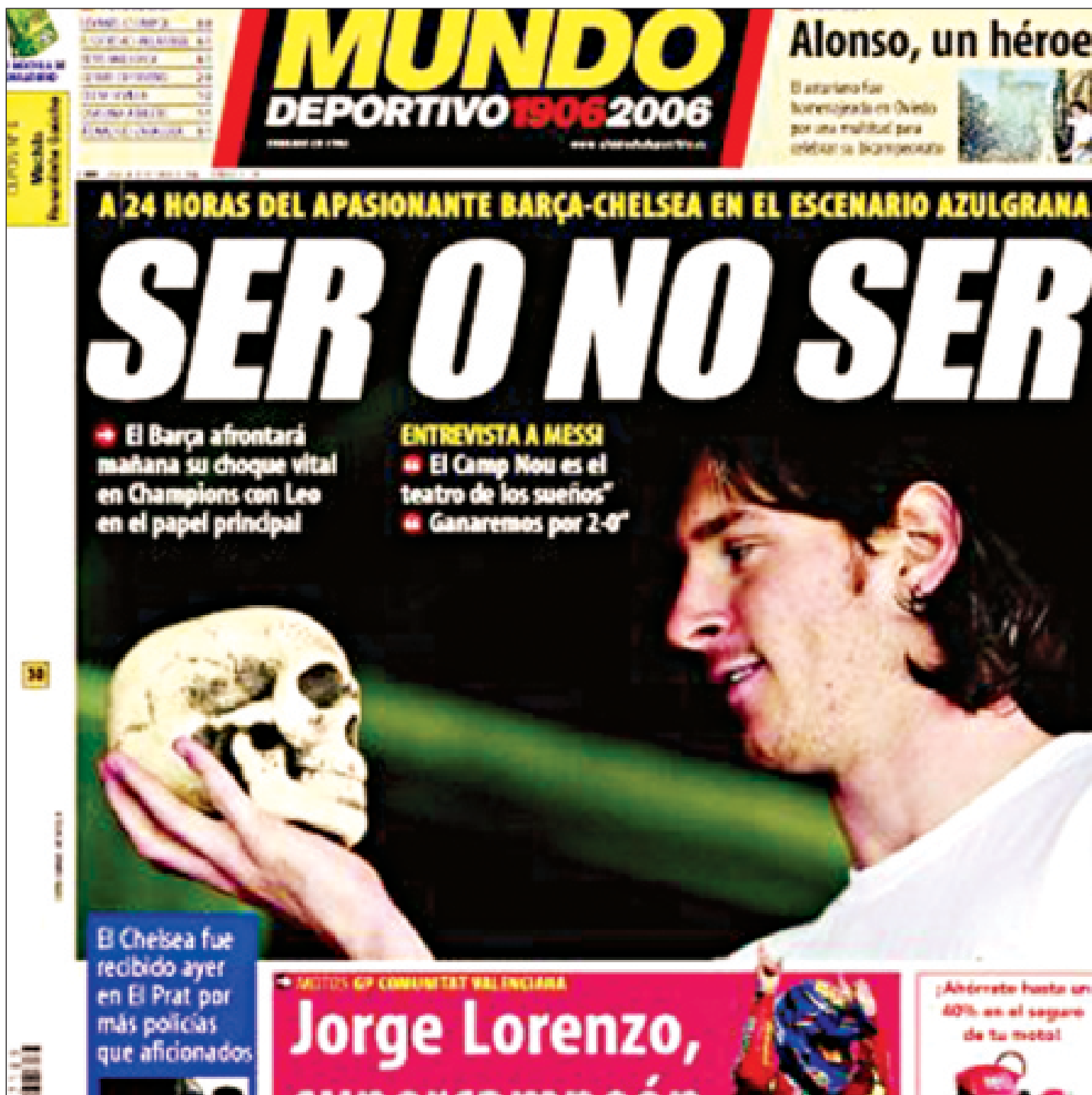
TO BE OR NOT TO BE: Spanish daily El Mundo Deportivo has on its cover a picture of Barcelona sensation Lionel Messi holding a skull and re-enacting the famous scene from Shakespeare's play Hamlet. Messi is posing as Hamlet and the Shakespearean pose is supposed to be in reply to Chelsea manager Jose Mourinho's claims of the 'many theatres in Barcelona'.