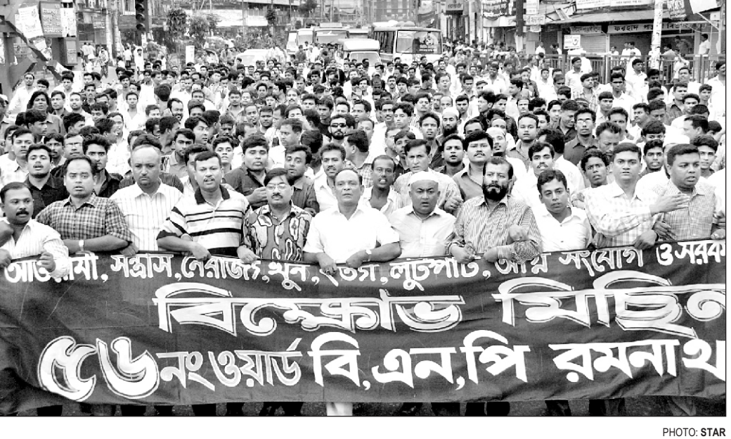
Ramna BNP takes out a procession at Muktangan in the city yesterday as part of BNP's agitation programme.

these judges had the chief justice's recommendations in favour of In addition to such recruitment,