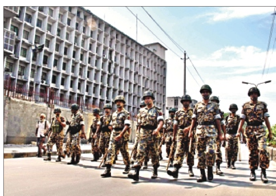
Bangladesh Rifles personnel patrol the street in front of Bangladesh Secretariat yesterday as security in the area was beefed up.