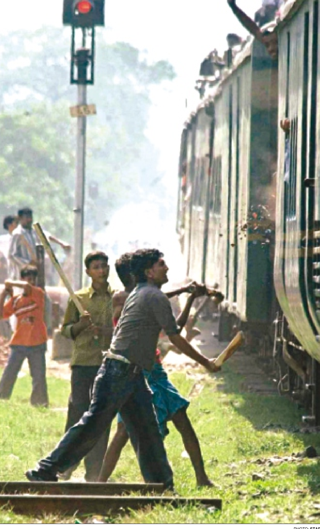
A train leaving Tongi Railway Station for Dhaka comes under attack of 14-party alliance activists during their blockade programme in the capital yesterday.

Nato's top commander apologised Saturday for civilian deaths caused by fighting between Taliban militants and Nato forces earlier in the week, but said insurgents