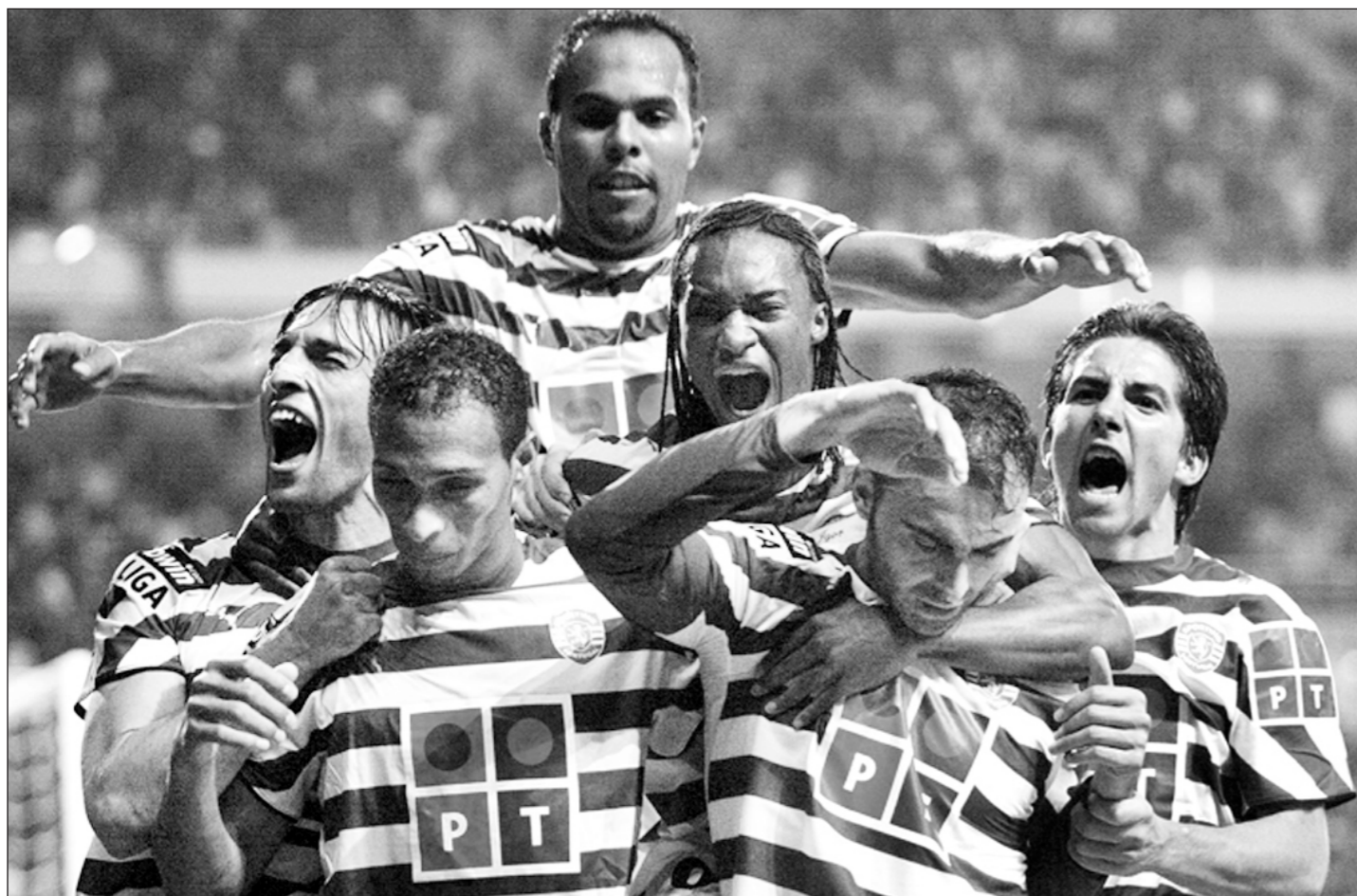
Sporting Lisbon players collectively celebrate a goal during their Portuguese Liga match against Beira Mar at the Mario Duarte Stadium in Aveiro on Friday.