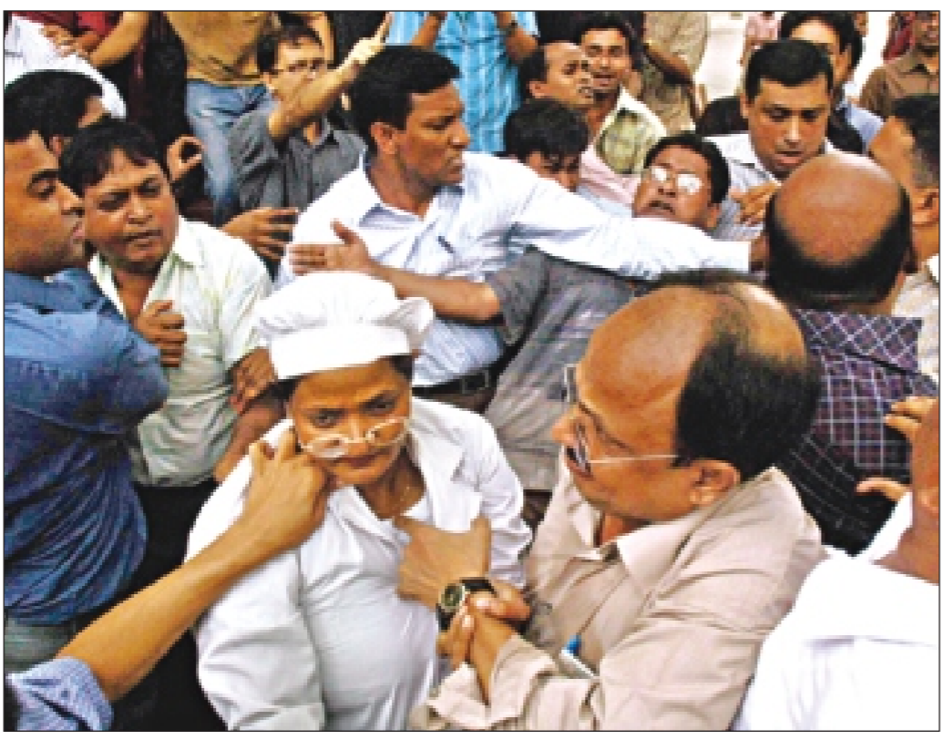
Doctors of the pro-Awami League Swadhinata Chikitsak Parishad yesterday attack a nurse belonging to pro-BNP Doctors' Association of Bangladesh at Bangabandhu Sheikh Mujib Medical University in the city.