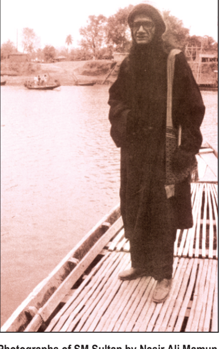
Photographs of SM Sultan

and drank water from the river. "While people kept books and gift items on